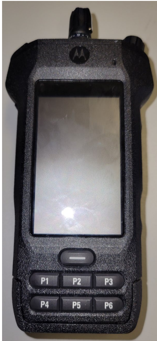
Front view with battery