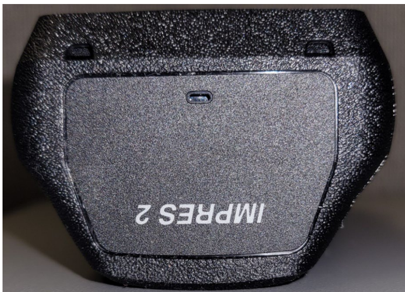
Bottom View with Battery