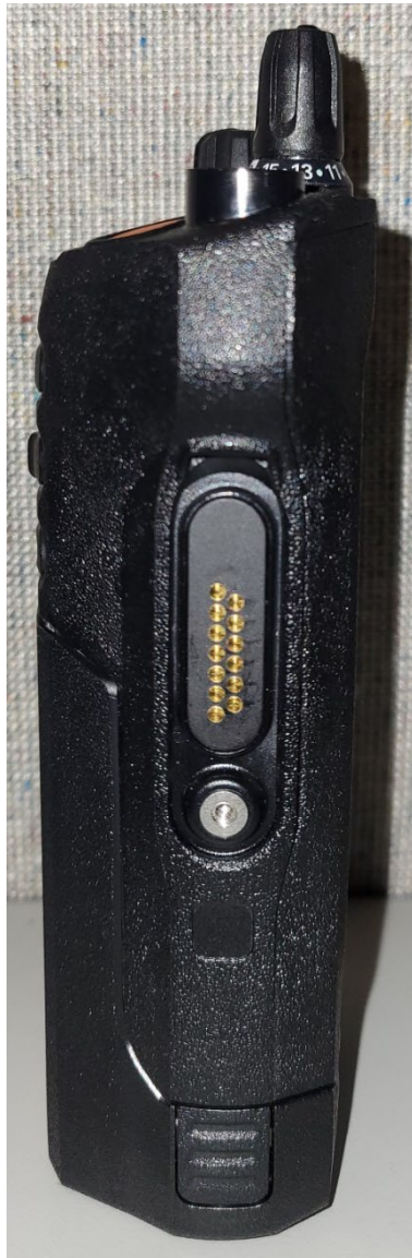
Side View (Left) with Battery