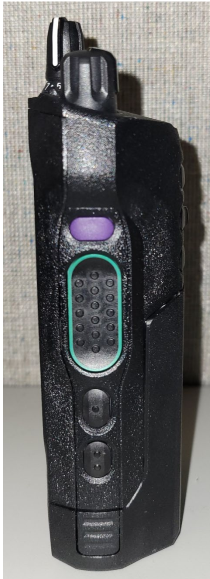
Side View (Right) with Battery