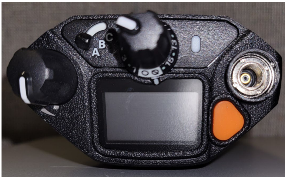
Top View with Battery