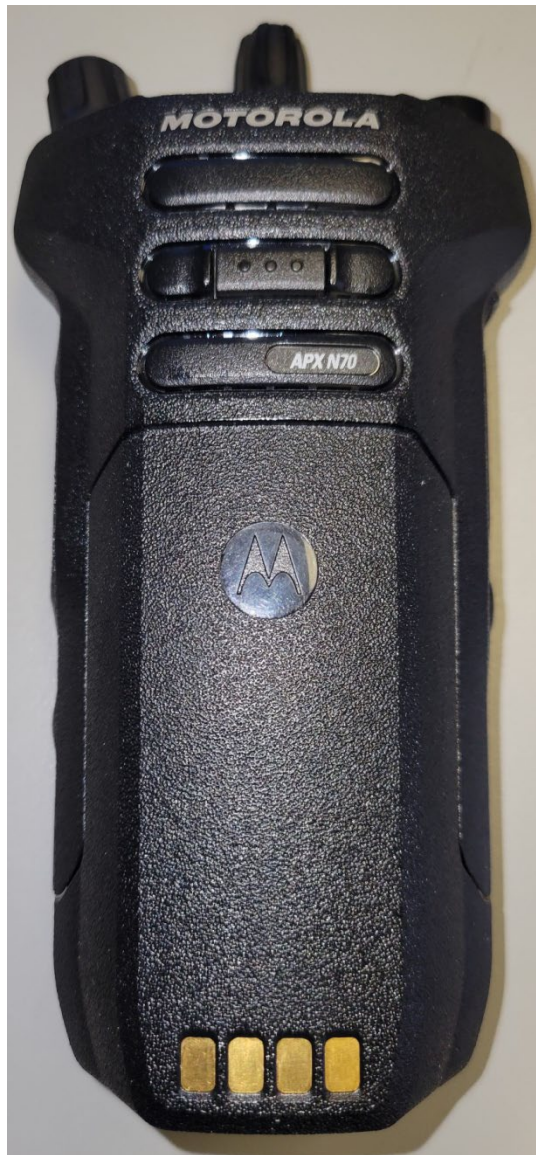
Back View with Battery