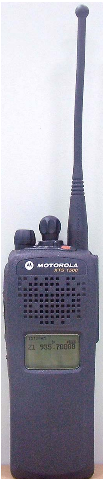
Figure 3-2: Front view of complete radio (Popular Keypad).