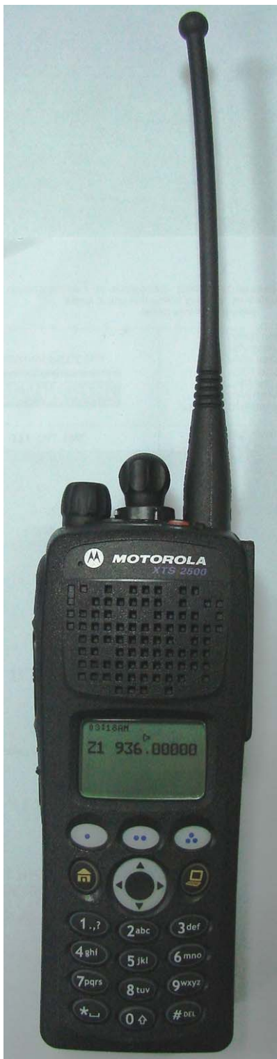
Figure 3-1: Front view of complete radio (Preferred Keypad).