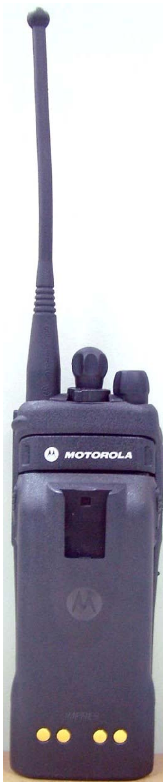
Figure 3-3: Back view of complete radio.