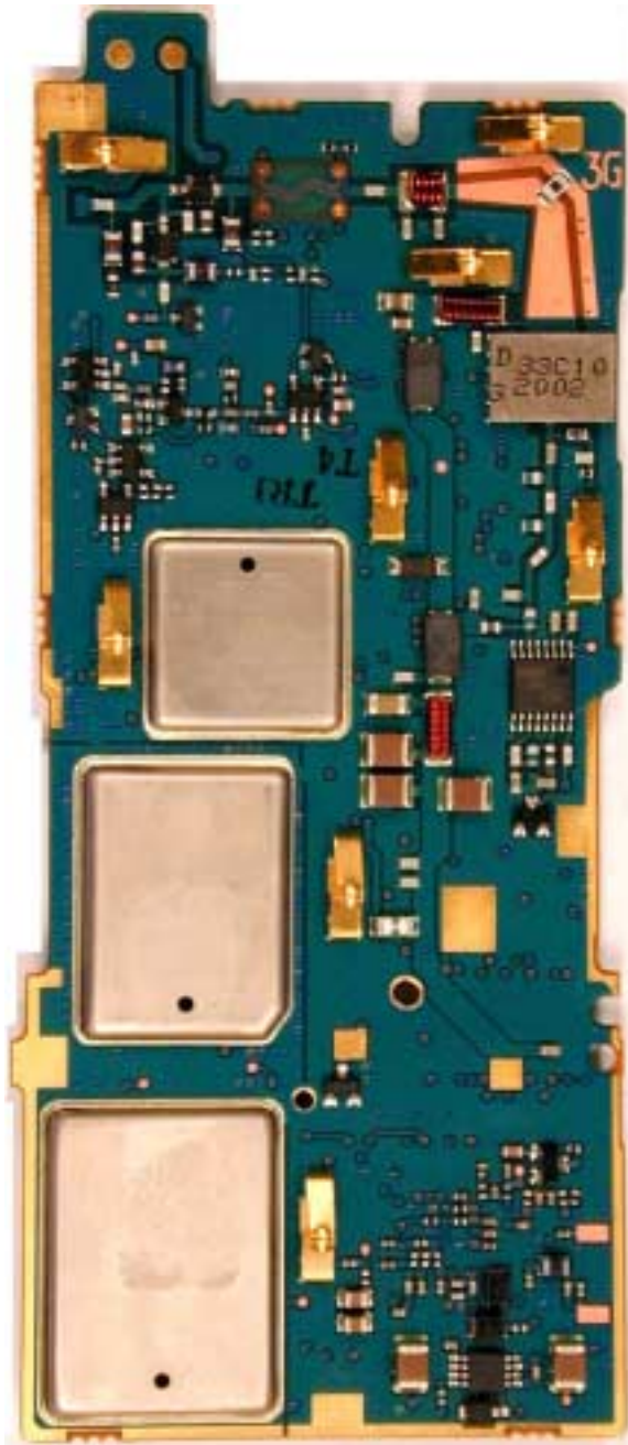
RF board with Shields (Bottom)