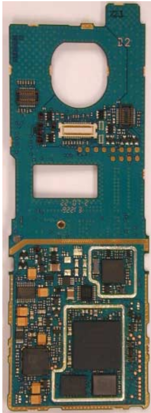
Vocon board without Shields (Top)