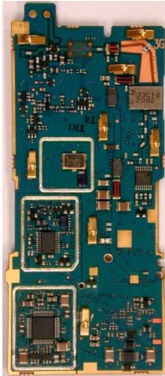
RF board without Shields (Bottom)