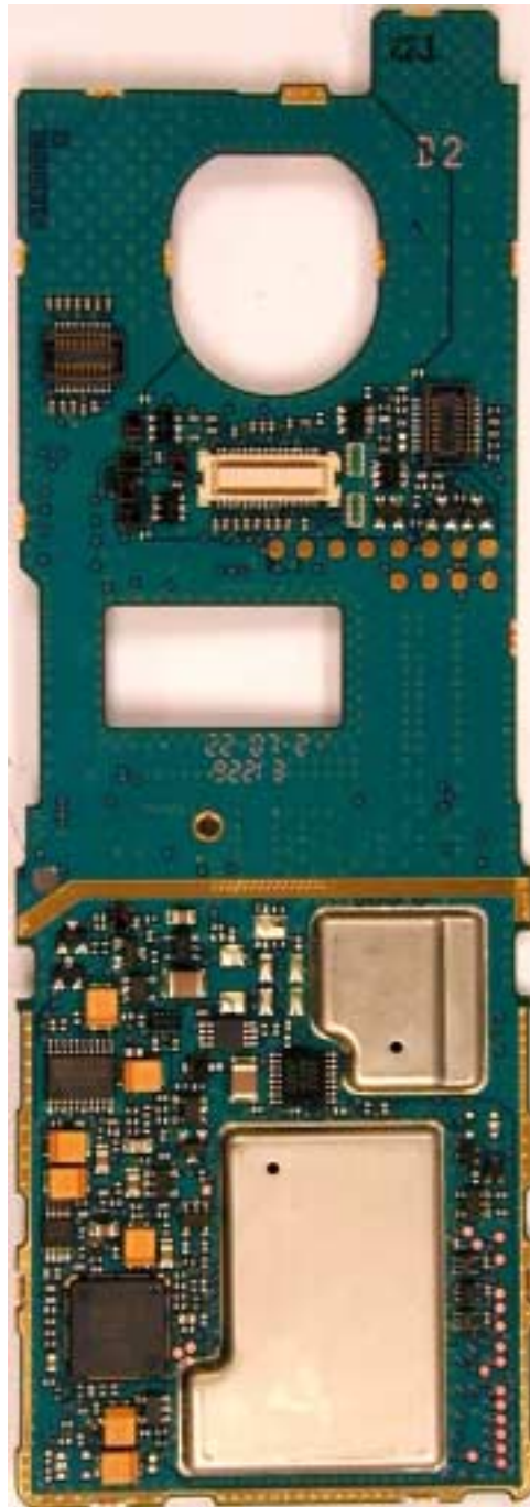
Vocon board with Shields (Top)