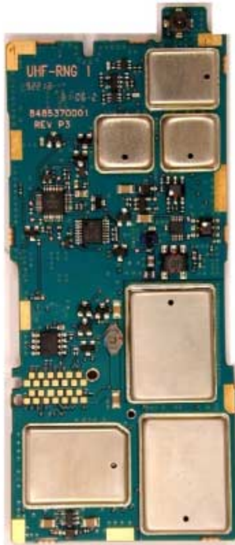
RF board with Shields (Top)