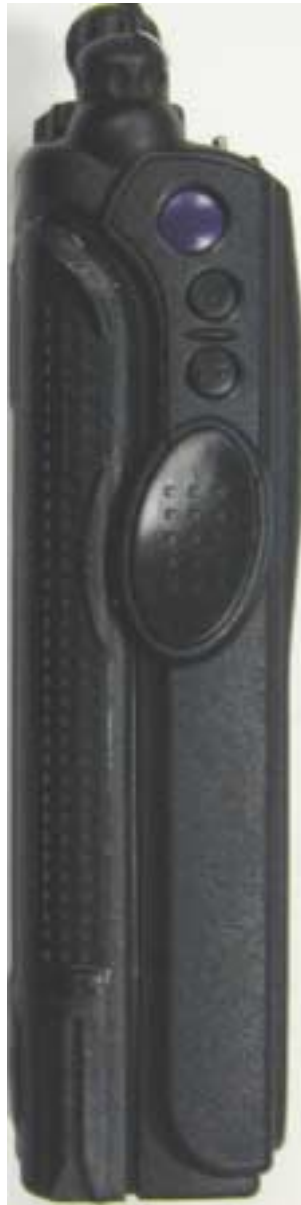
SIDE VIEW (LEFT)