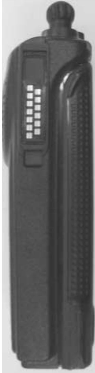
SIDE VIEW (RIGHT)