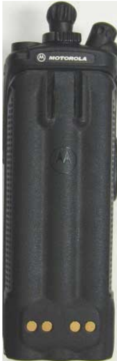
BACK VIEW WITH BATTERY