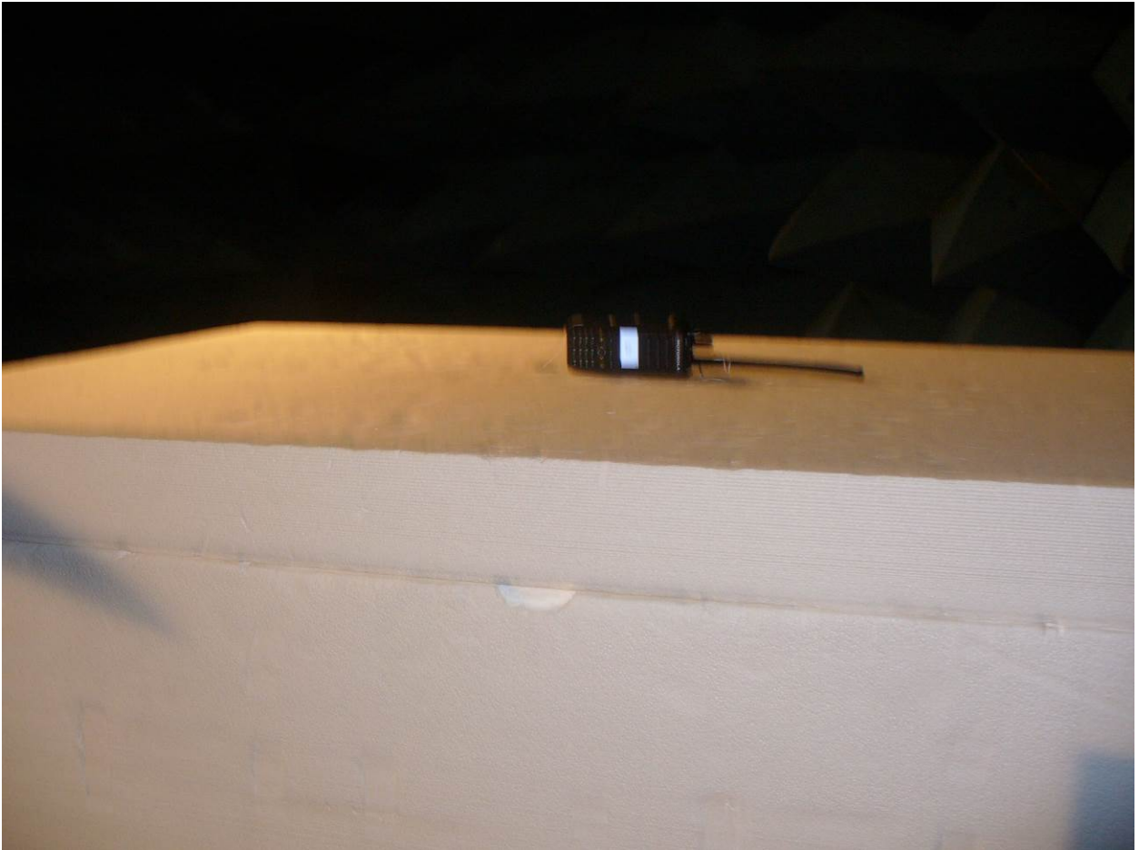
Figure 3: Radiated Emissions – Front View – EUT on Side