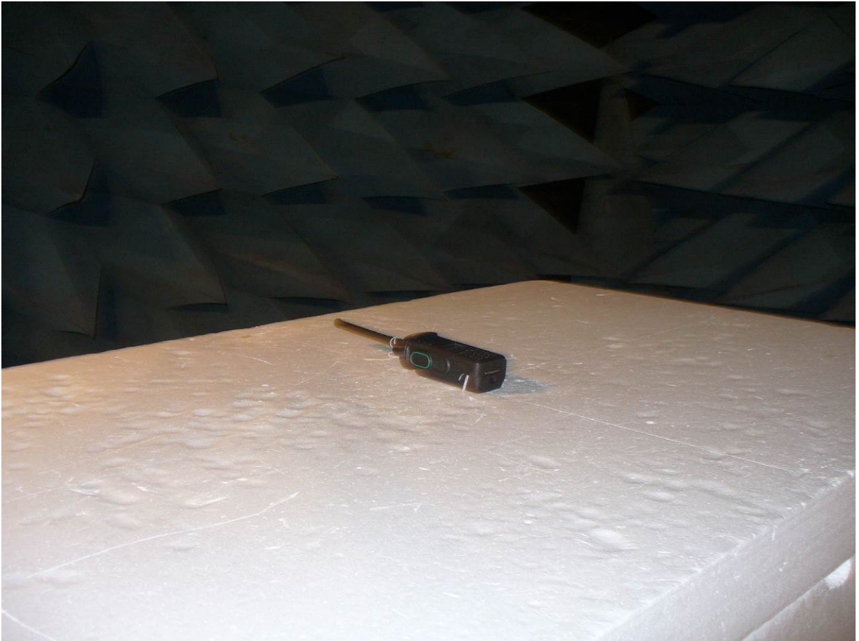
Figure 5: Radiated Emissions – Front View – EUT Flat