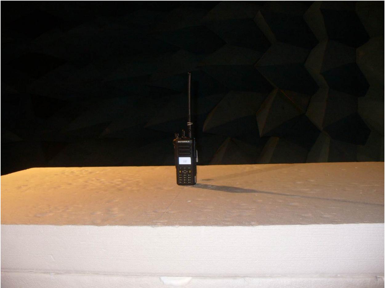
Figure 1: Radiated Emissions – Front View – EUT Standing