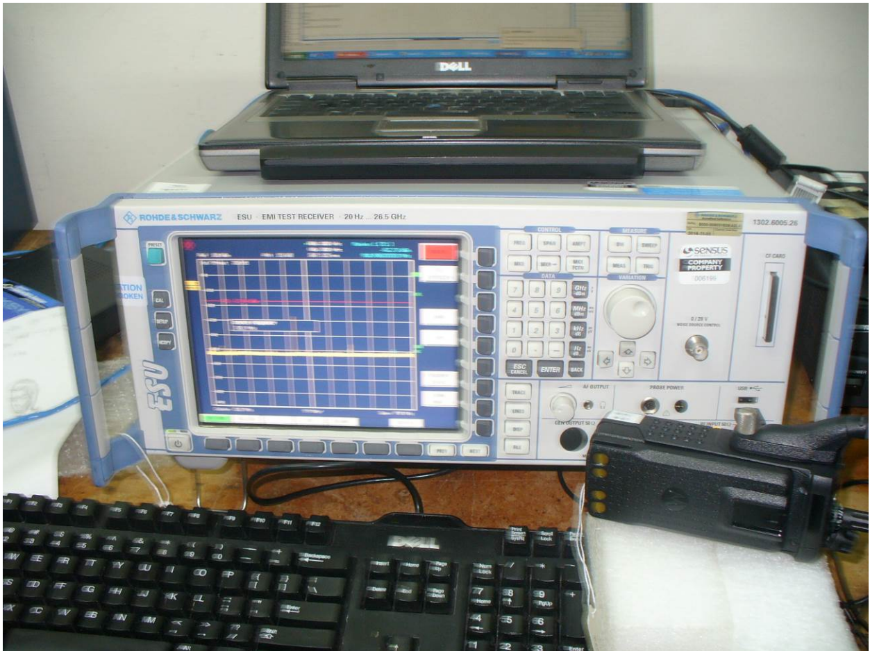
Figure 7: RF Conducted Emissions