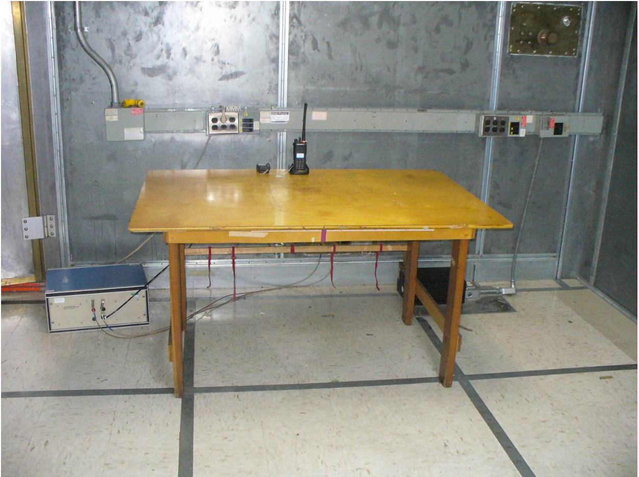
Figure 8: Power Line Conducted Emissions – Front View