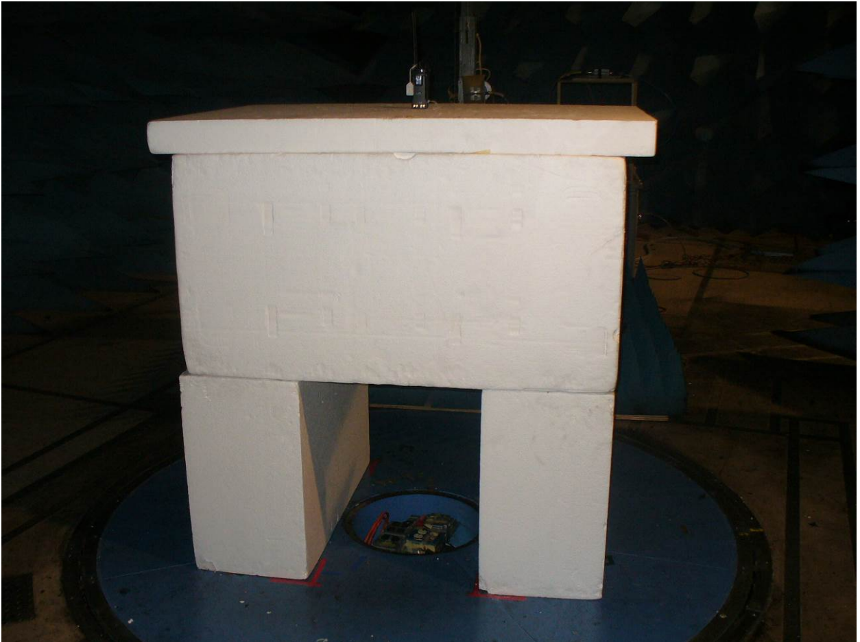
Figure 2: Radiated Emissions – Back View – EUT Standing