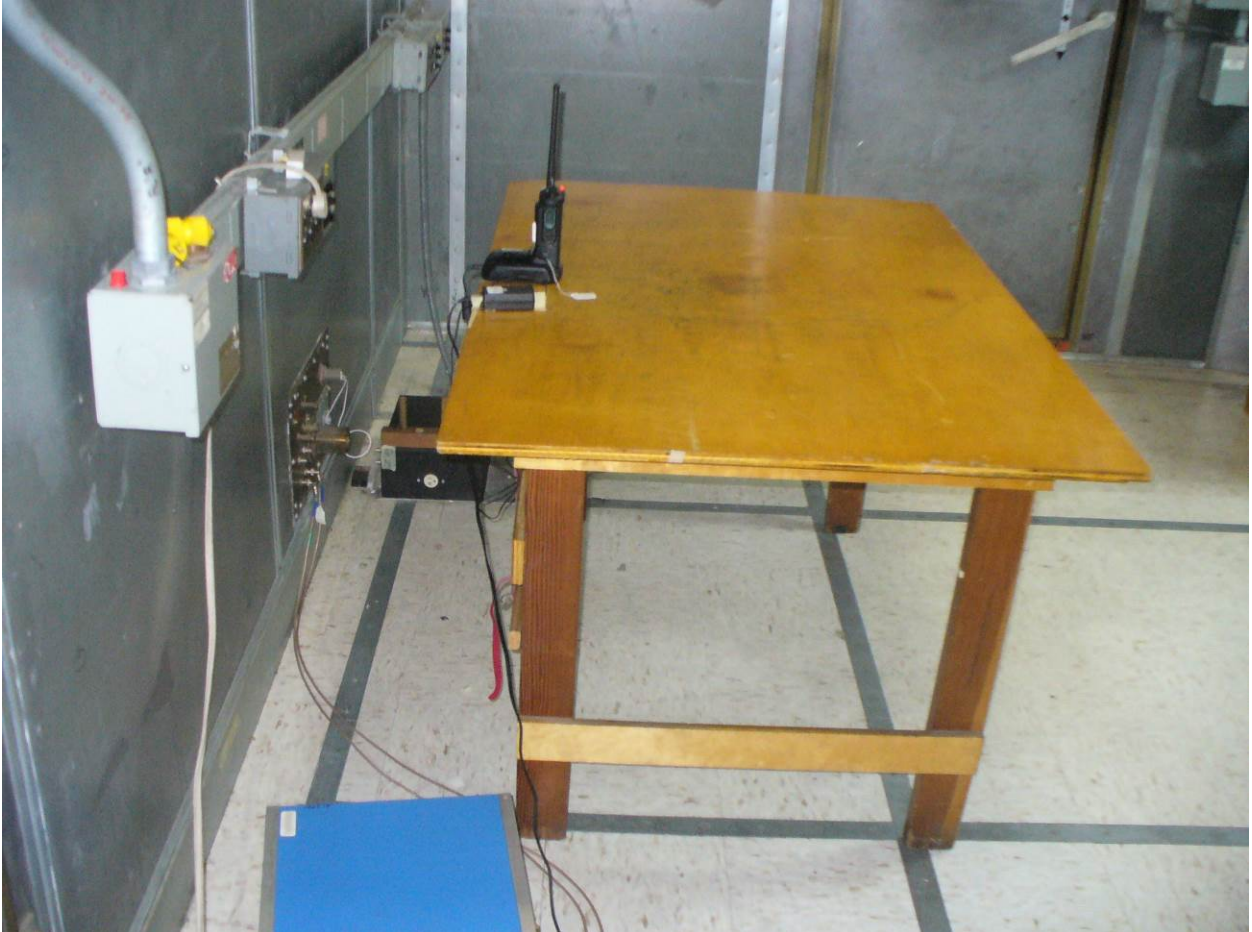
Figure 9: Power Line Conducted Emissions – Side View