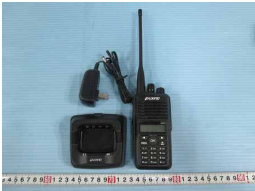
EUT – Full View