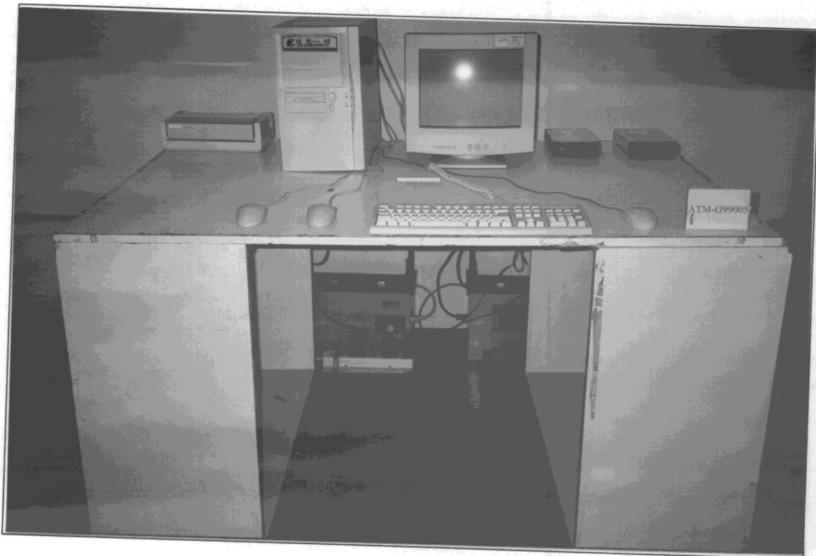
FRONT VIEW OF CONDUCTED TEST