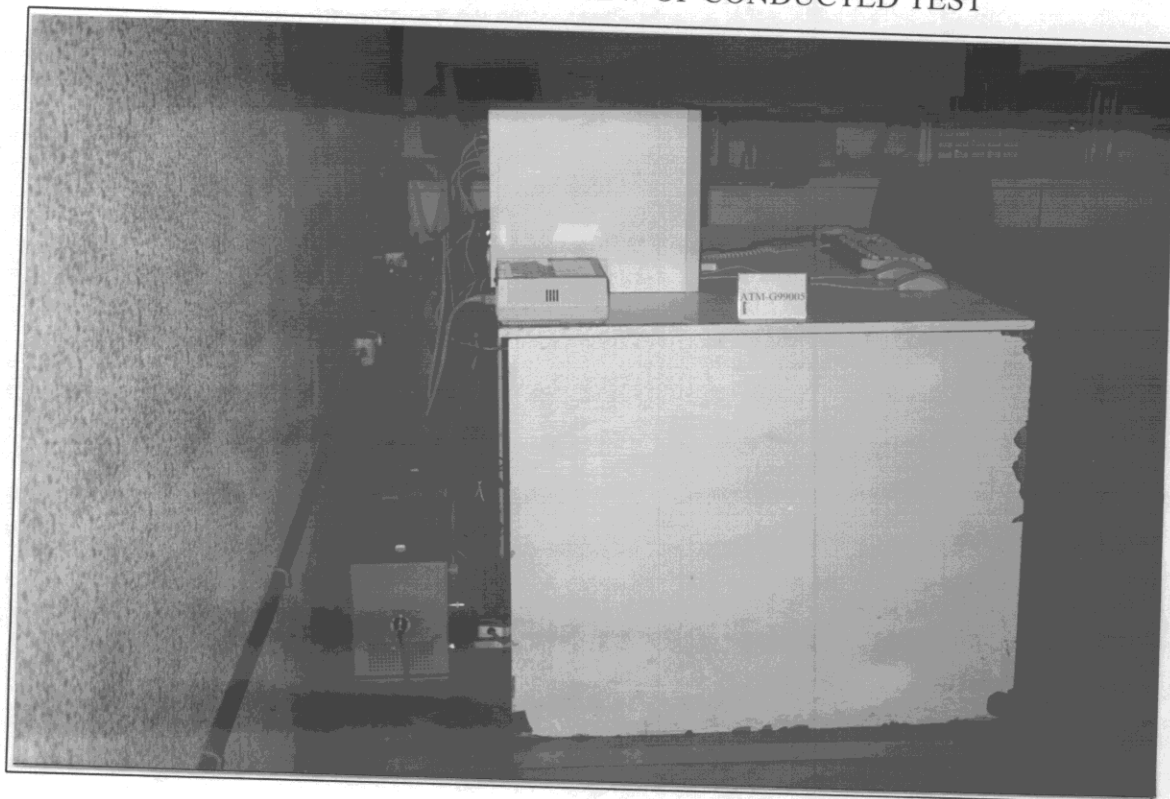
BACK VIEW OF CONDUCTED TEST