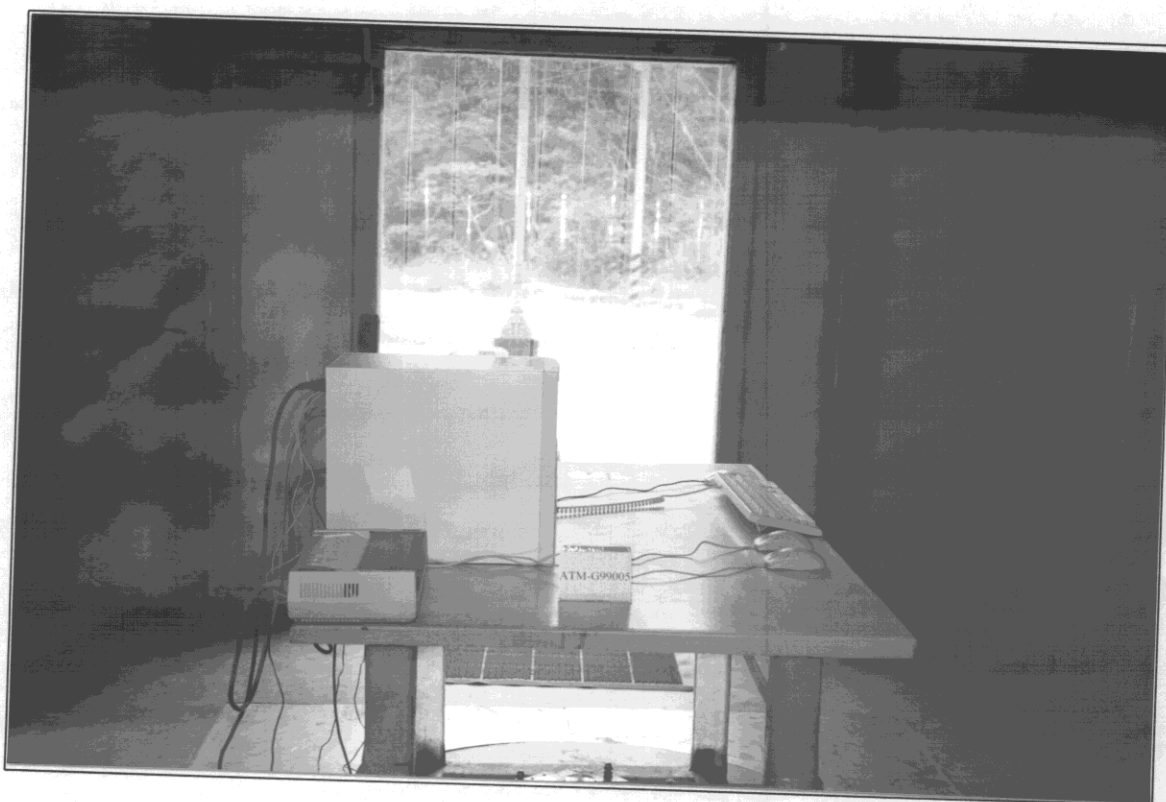
SETUP WITH MAXIMUM DETECTED EMISSION AT HORIZONTAL POLARIZATION