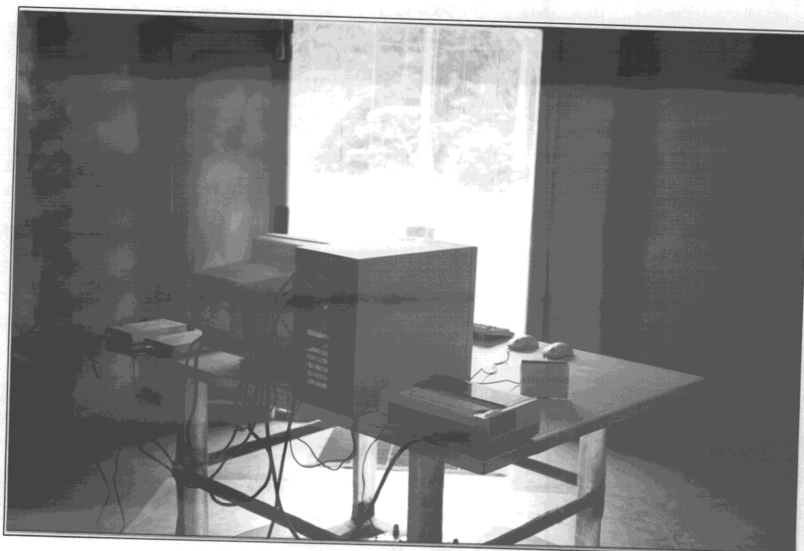
SETUP WITH MAXIMUM DETECTED EMISSION AT VERTICAL POLARIZATION