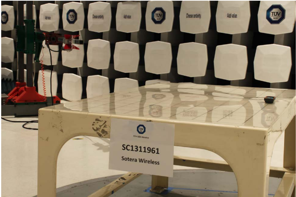
Radiated Emissions Test Setup