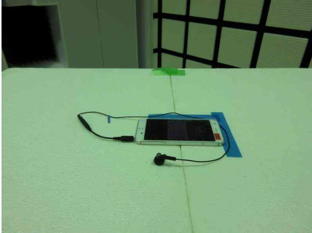
– X-axis –