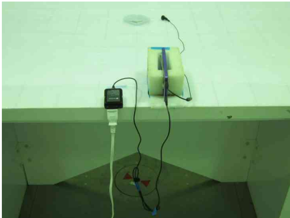
- Y axis -