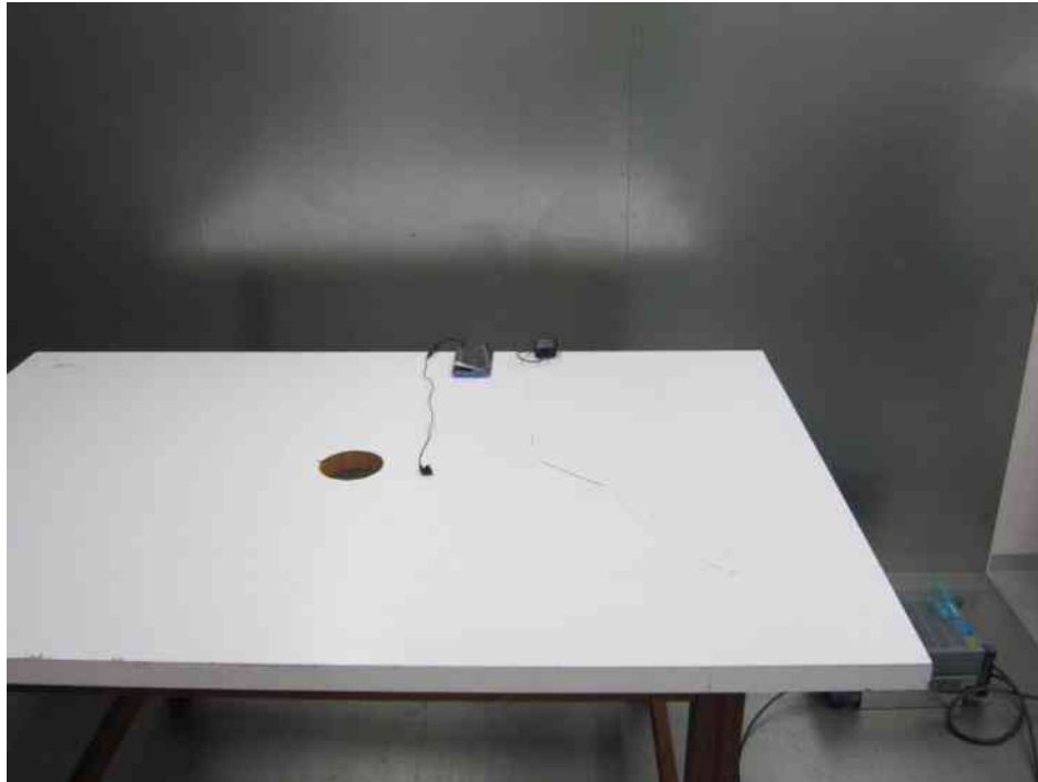
– Front View –