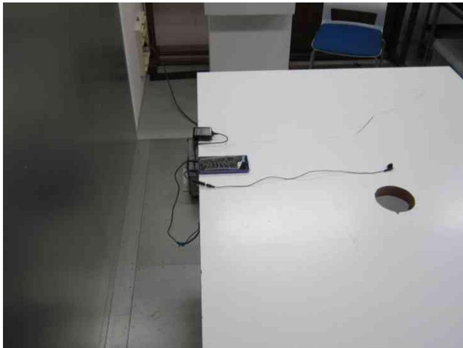
– Side View –

Photograph present configuration with maximum emission