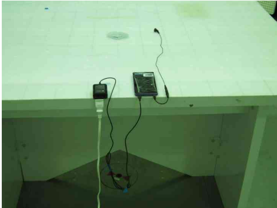
- X axis -