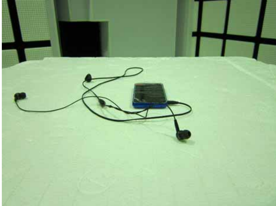
– X-axis –