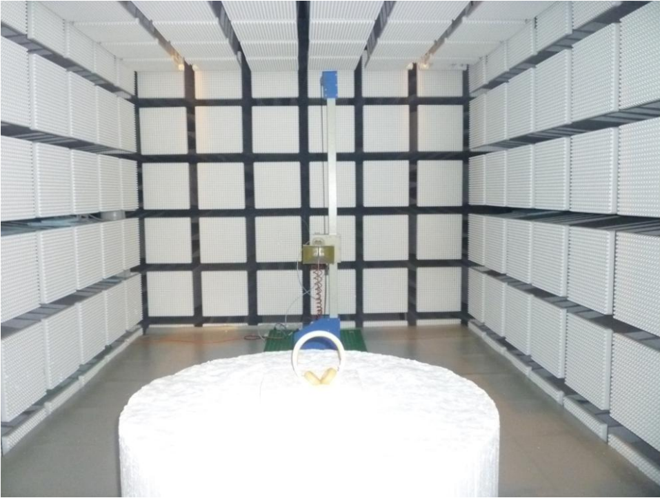
Transmitting spurious emission (Above 1GHz)