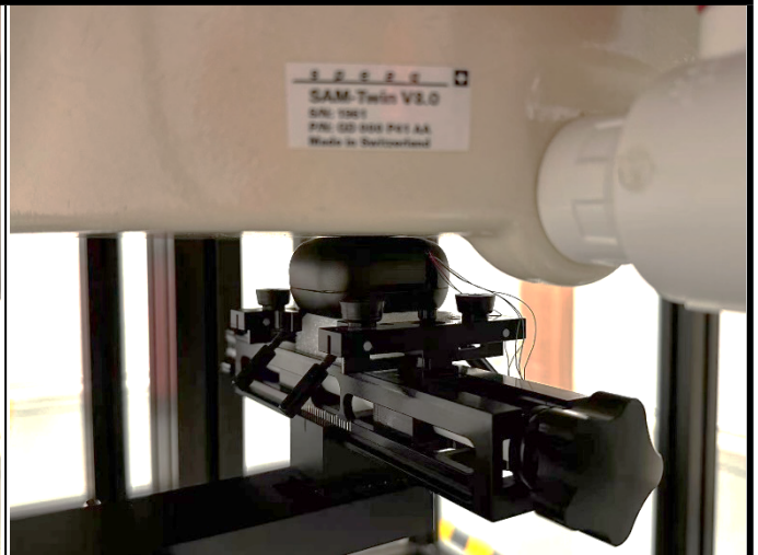
Rear Face with 0 cm Gap