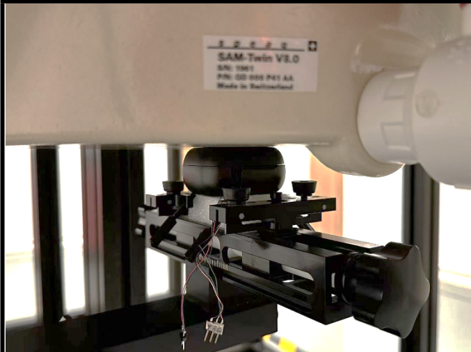
Front Face with 0 cm Gap