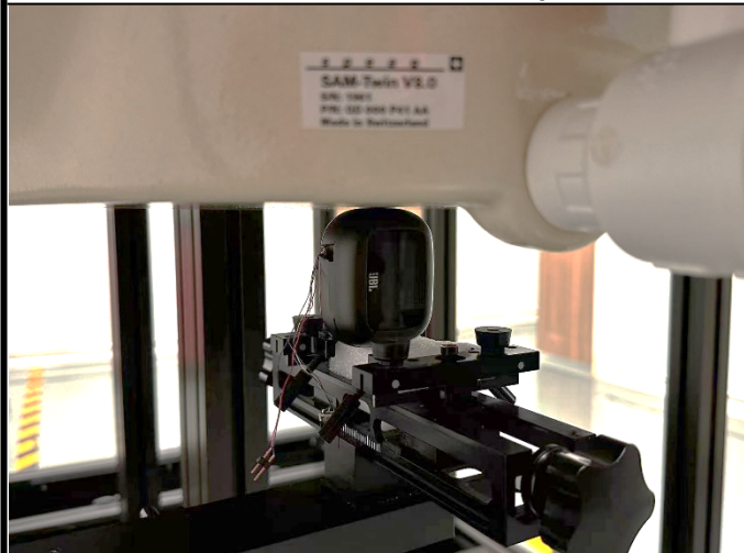
Left Side with 0 cm Gap