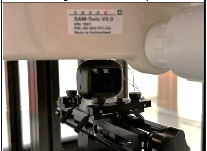
Bottom Side with 0 cm Gap