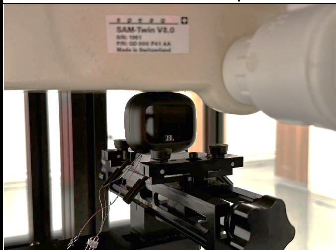
Top Side with 0 cm Gap