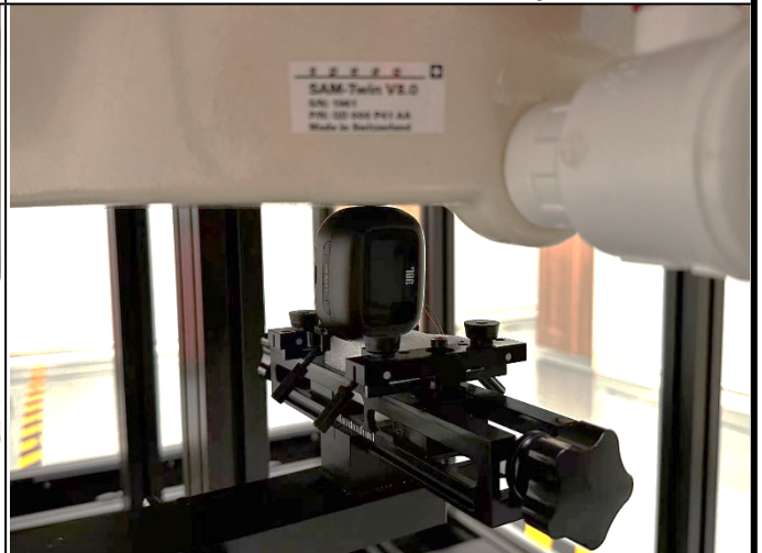
Right Side with 0 cm Gap