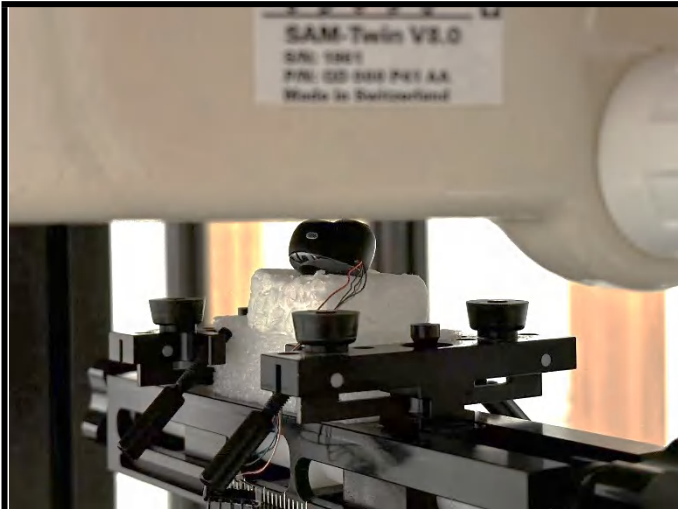
Inside of Left Earbud with 0 cm Gap