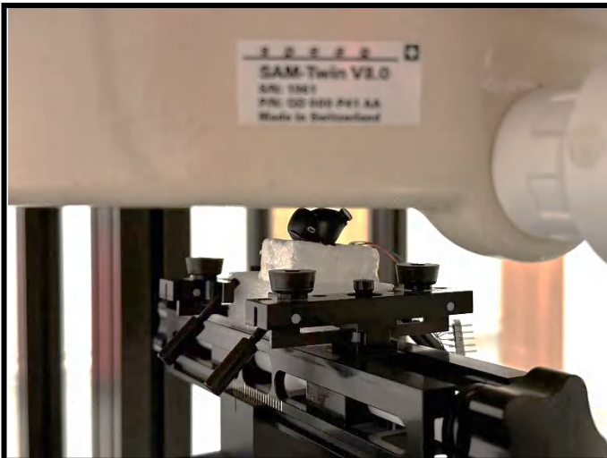
Inside of Right Earbud with 0 cm Gap