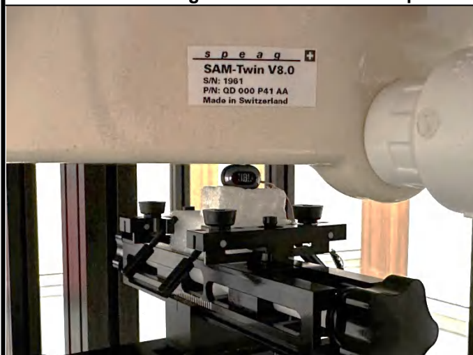
Top Side of Right Earbud with 0 cm Gap