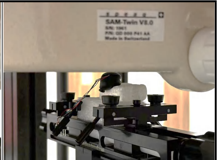
Rear Face of Left Earbud with 0 cm Gap