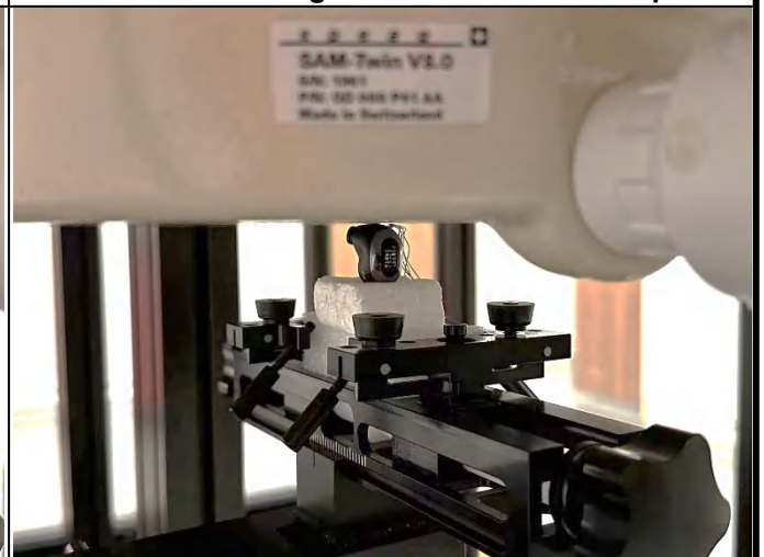
Right Side of Right Earbud with 0 cm Gap