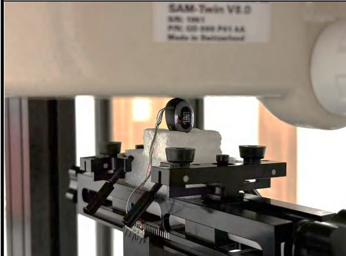
Left Side of Left Earbud with 0 cm Gap