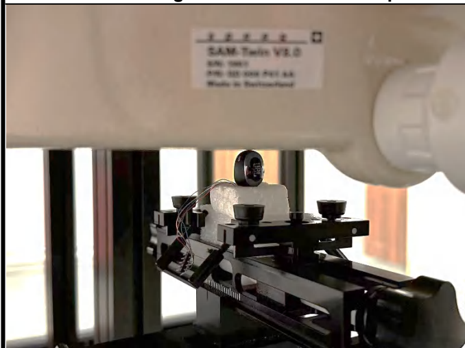
Left Side of Right Earbud with 0 cm Gap