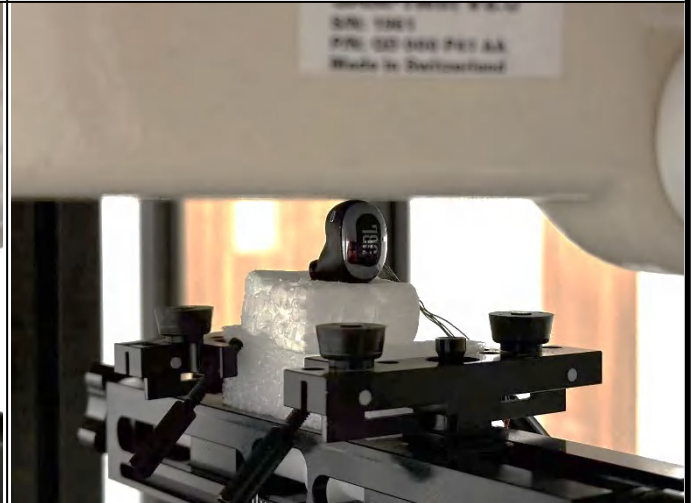
Right Side of Left Earbud with 0 cm Gap