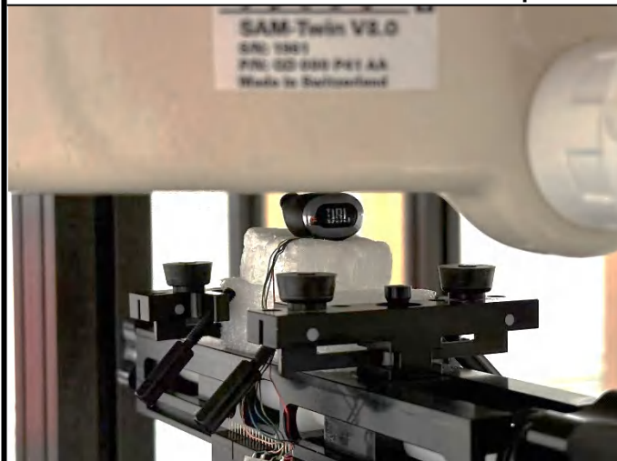
Top Side of Left Earbud with 0 cm Gap