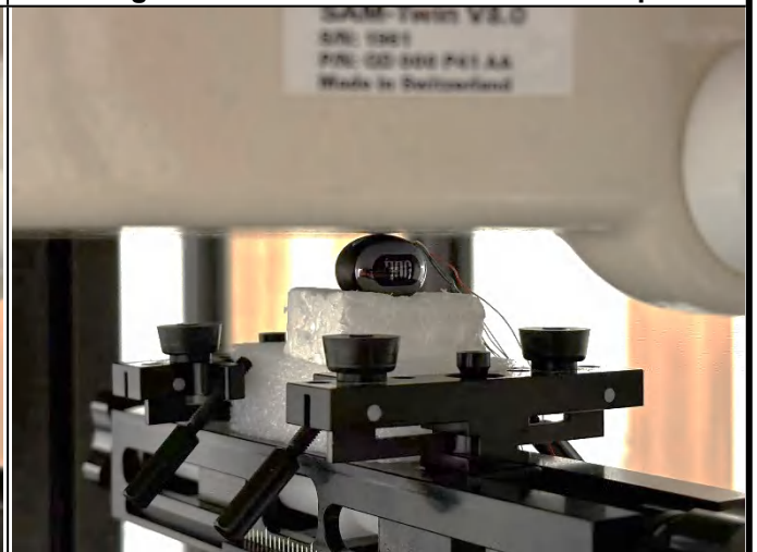
Bottom Side of Left Earbud with 0 cm Gap