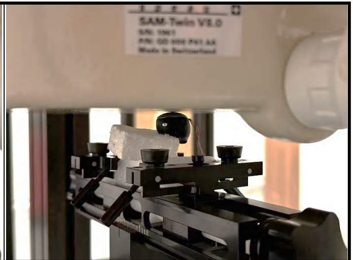
Rear Face of Right Earbud with 0 cm Gap