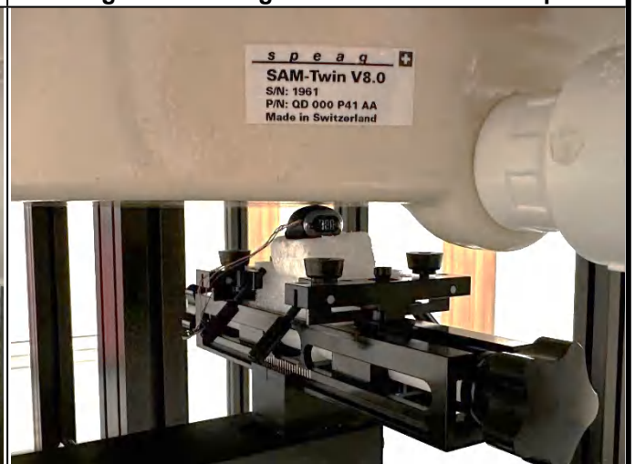
Bottom Side of Right Earbud with 0 cm Gap