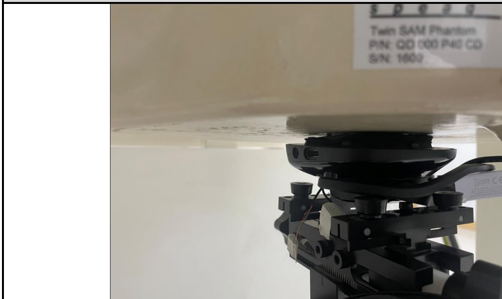
Side 1 0mm