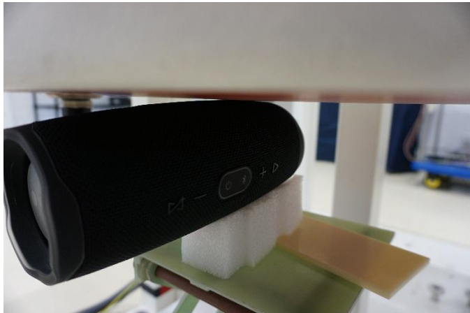
Right side (0mm)