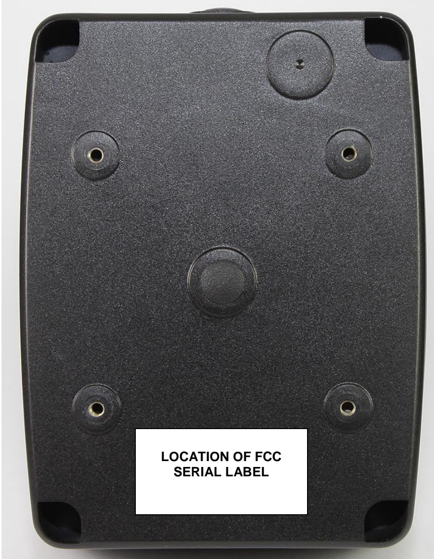
EXHIBIT: RQX-156M back view showing FCC Identification label location

Photographs indicate the location of the FCC label on the case and do not represent the actual FCC label. A label drawing is included with this certification request as a separate exhibit.