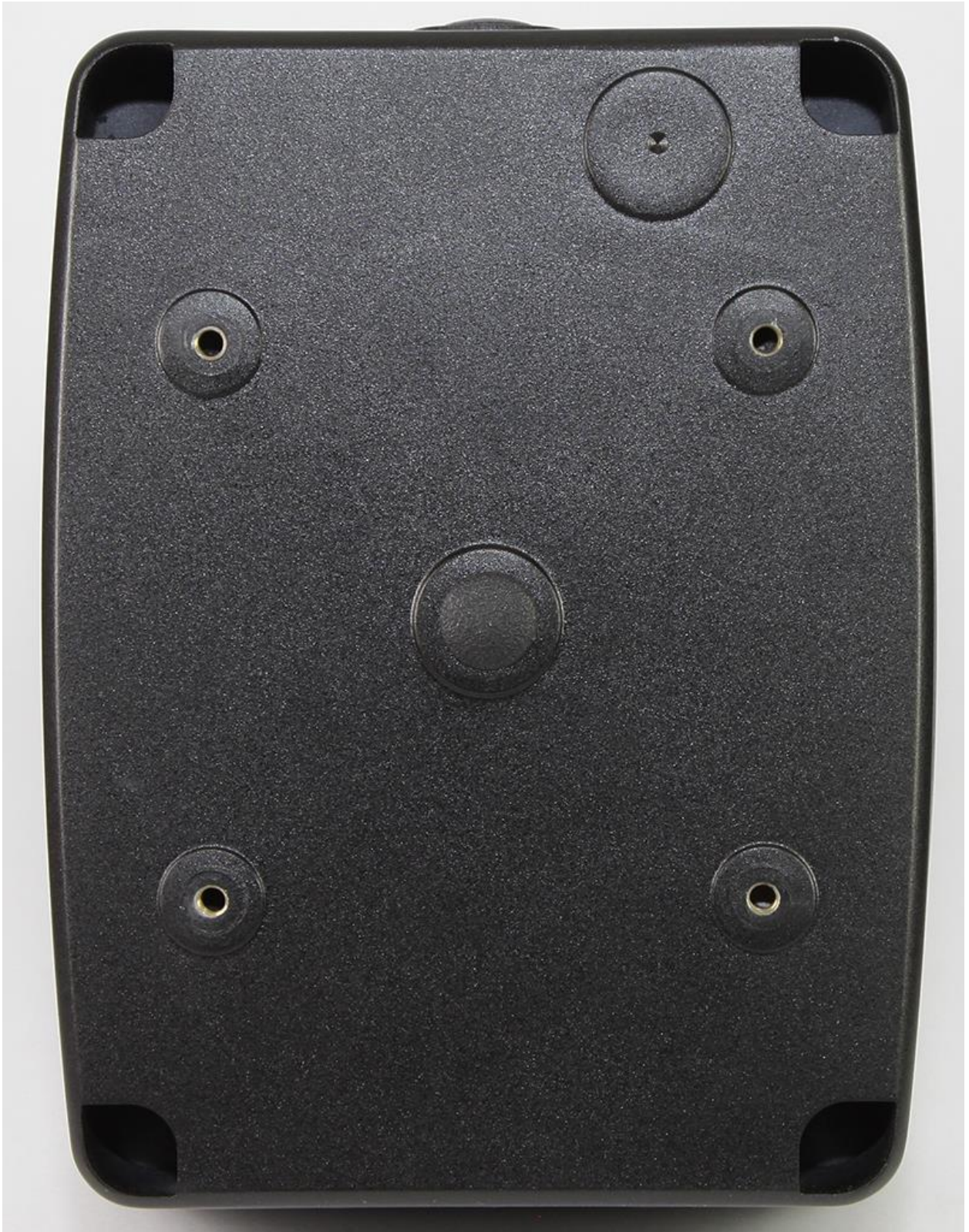
EXHIBIT: RQX-156 back view