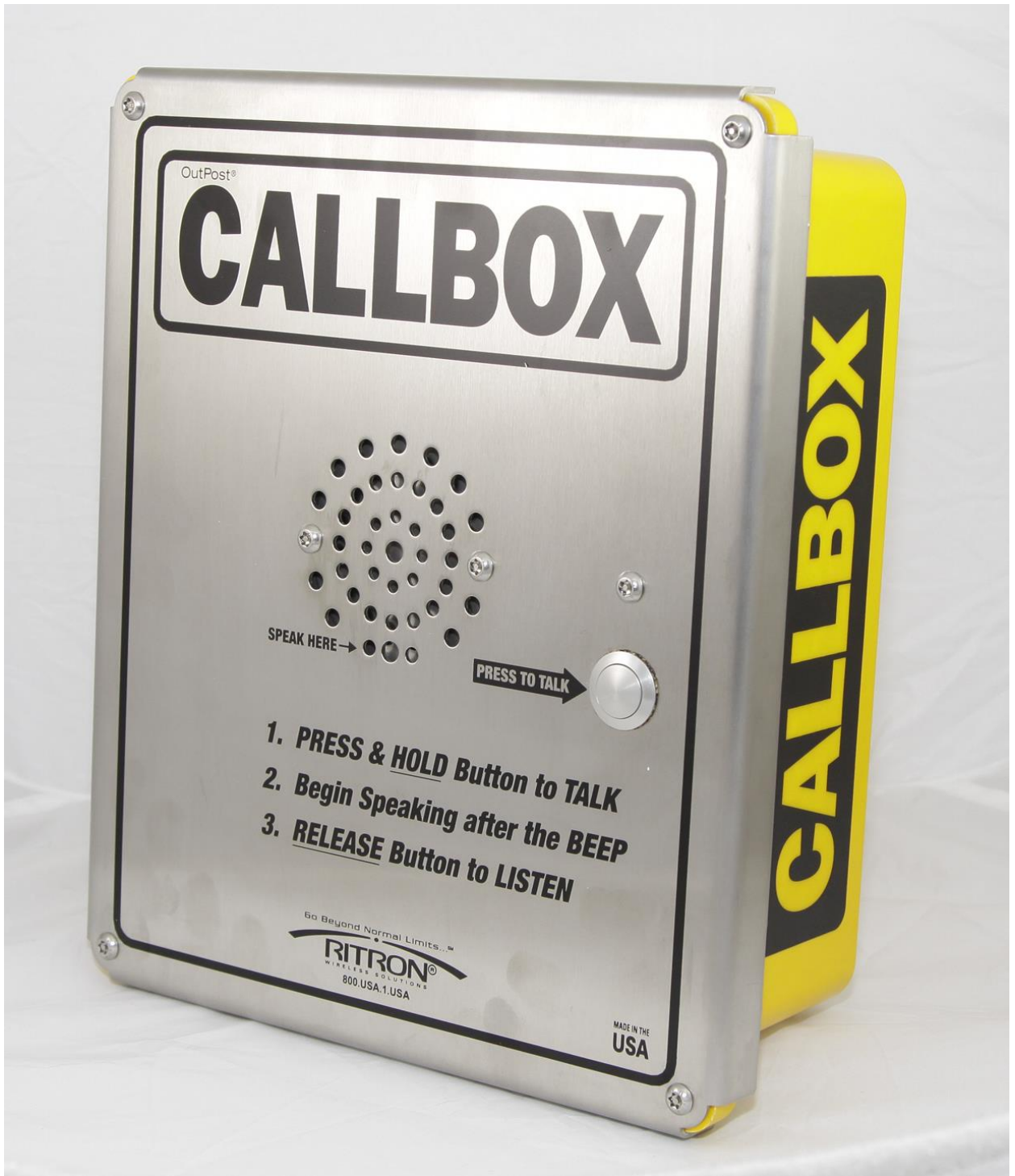
EXHIBIT: RQX-156-XT front view showing controls