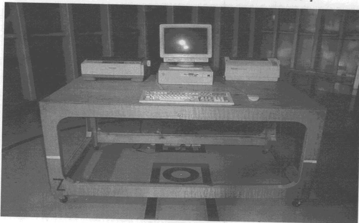
( Front )