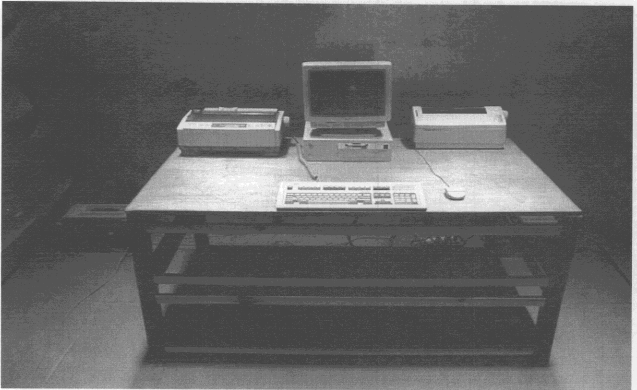
( Front )