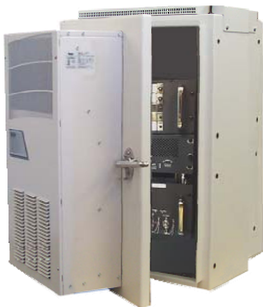
(Front View, Cabinet Partially Open)