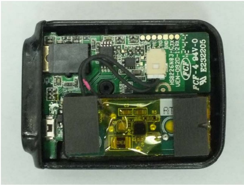
EXHIBIT 9B - PCB Bottom layer inside housing