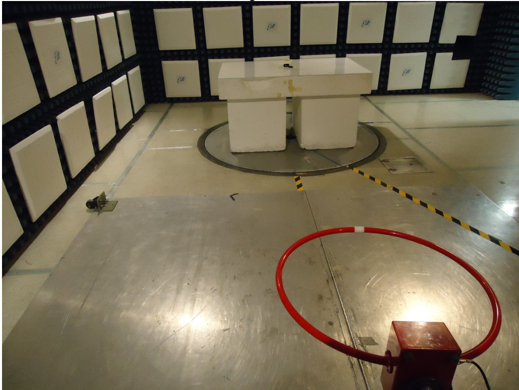
Test Setup for Radiated Emissions, 10kHz to 30MHz – Horizontal Polarization