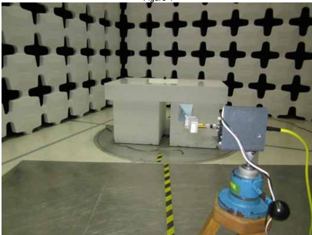
Test Setup for Radiated Emissions, above 18GHz – Horizontal Polarization