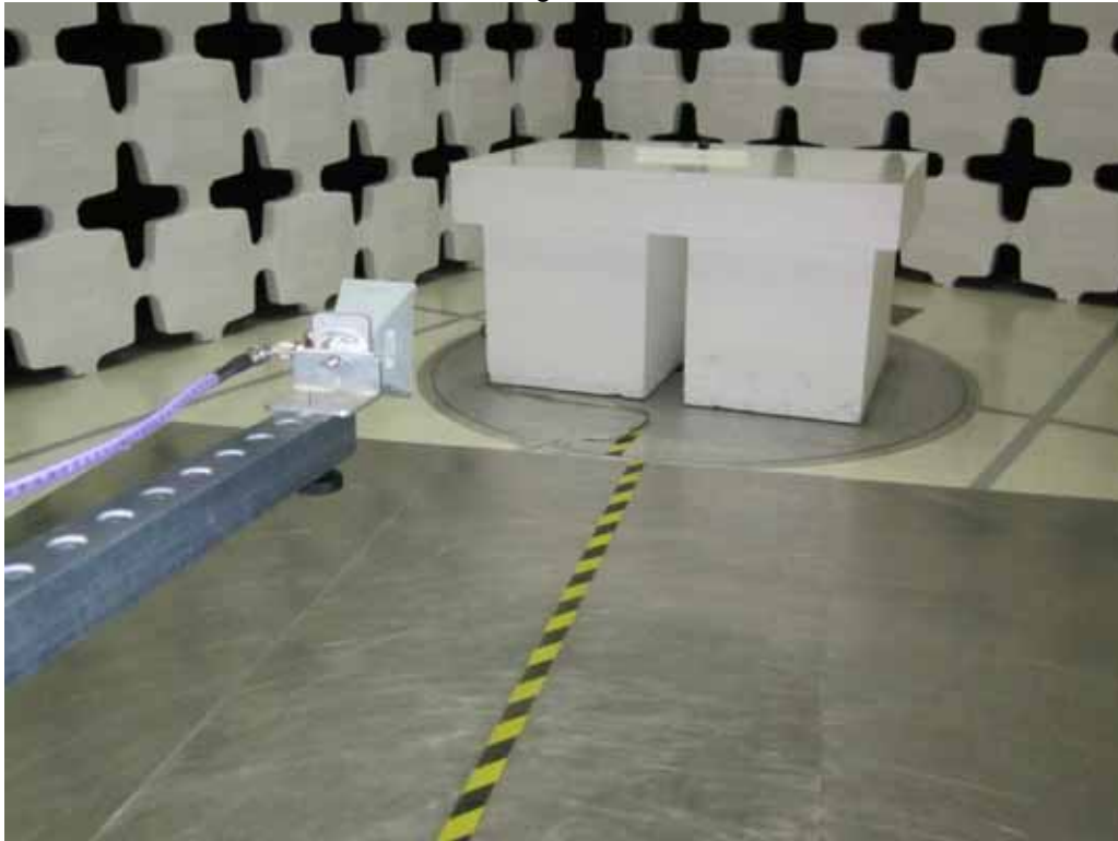
Test Setup for Radiated Emissions, 2GHz to 18GHz – Horizontal Polarization