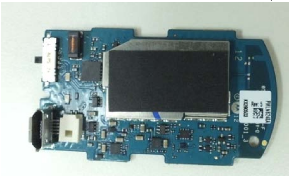
Main board with Shields (Top)