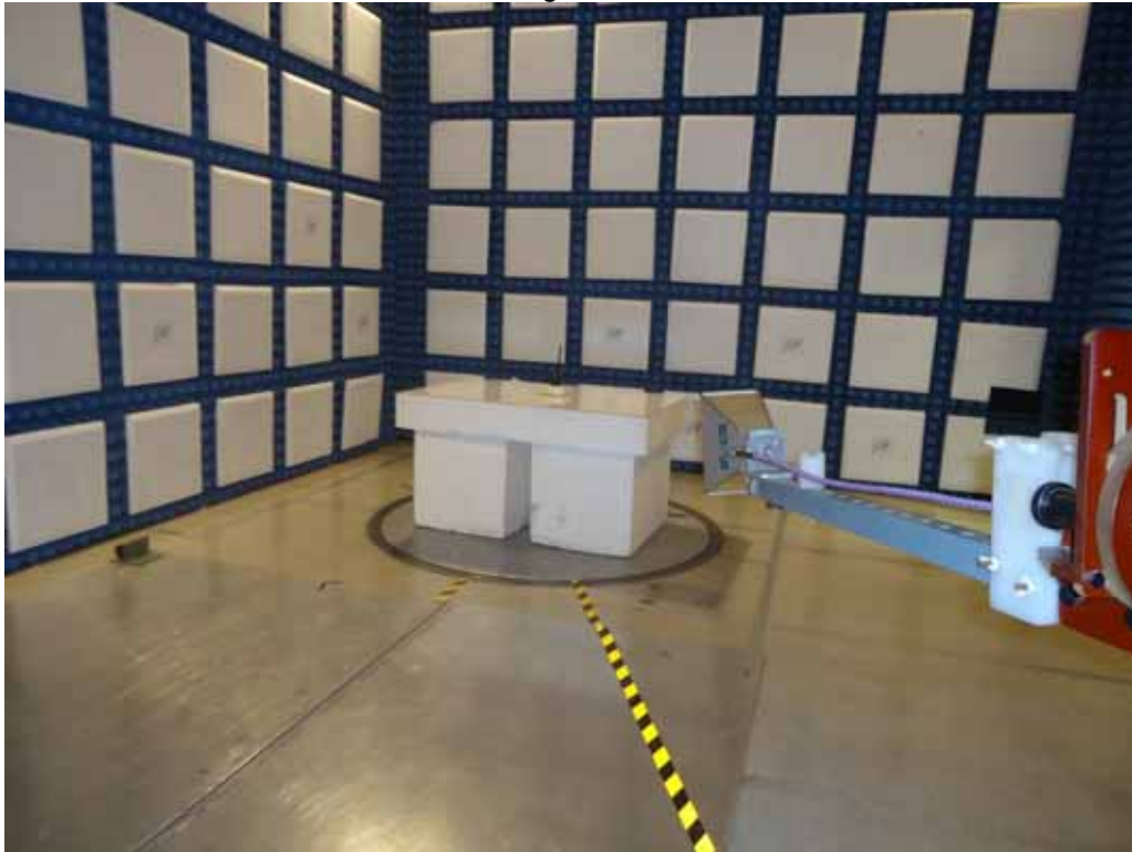
Test Setup for Radiated Emissions, above 1GHz – Horizontal Polarization