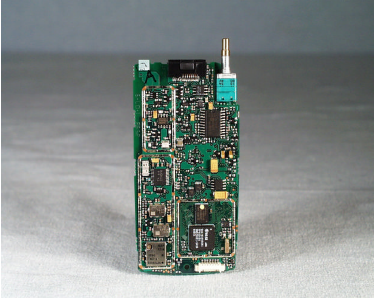
Solder side of the interface board