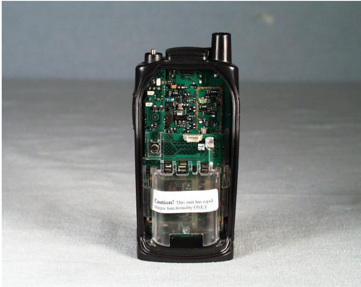
Inside View of the AAS19ZAL9022AA