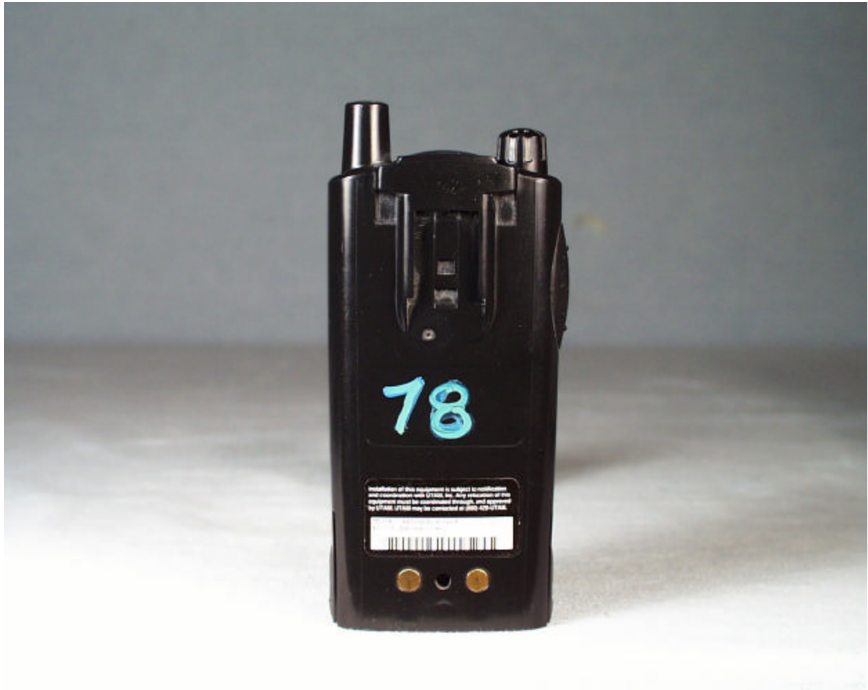
Photograph Showing Label Placement