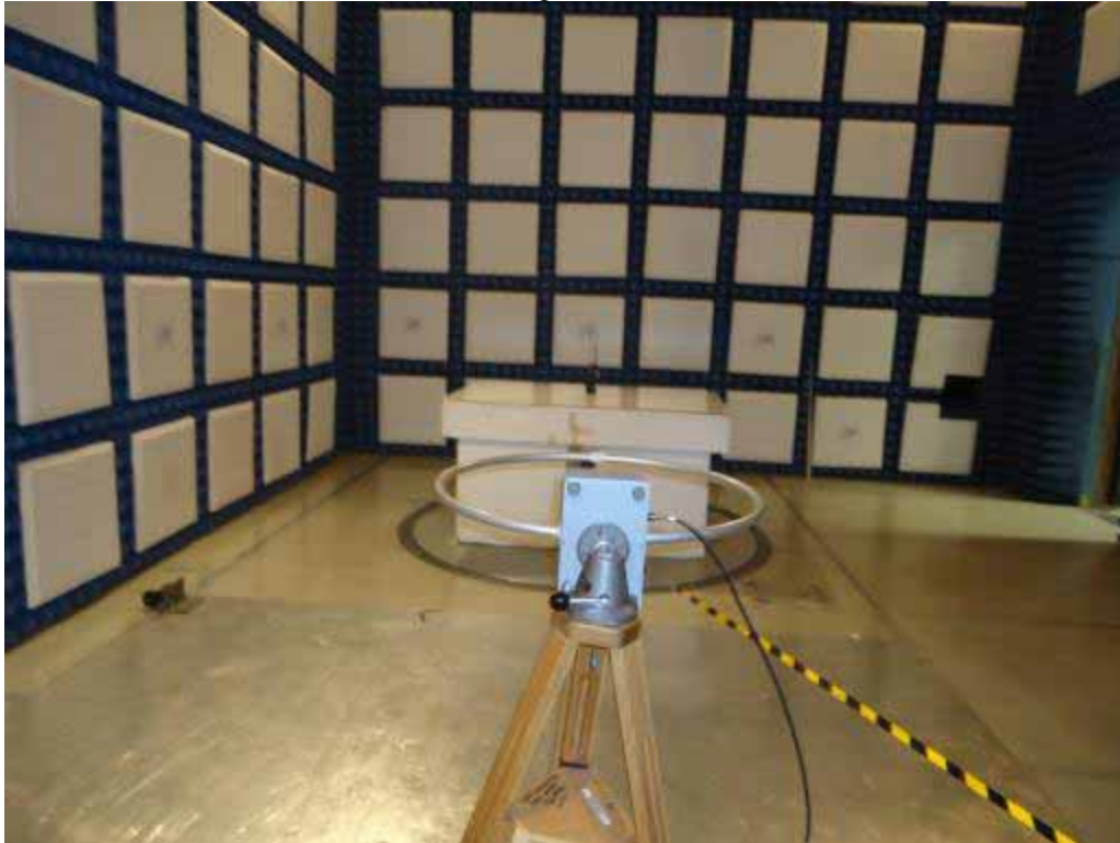
Test Setup for Radiated Emissions, 10kHz to 30MHz – Horizontal Polarization