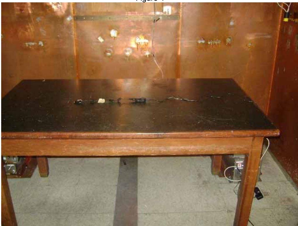
Test Setup for Conducted Emissions