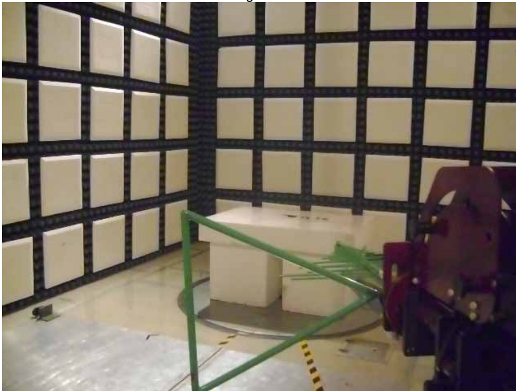
Test Setup for Radiated Emissions, 30MHz to 1GHz – Horizontal Polarization