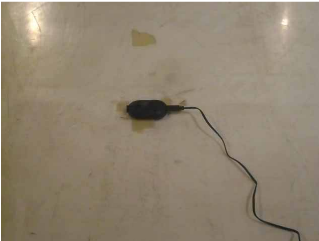
EUT With Motorola AC Power Supply, No Headset