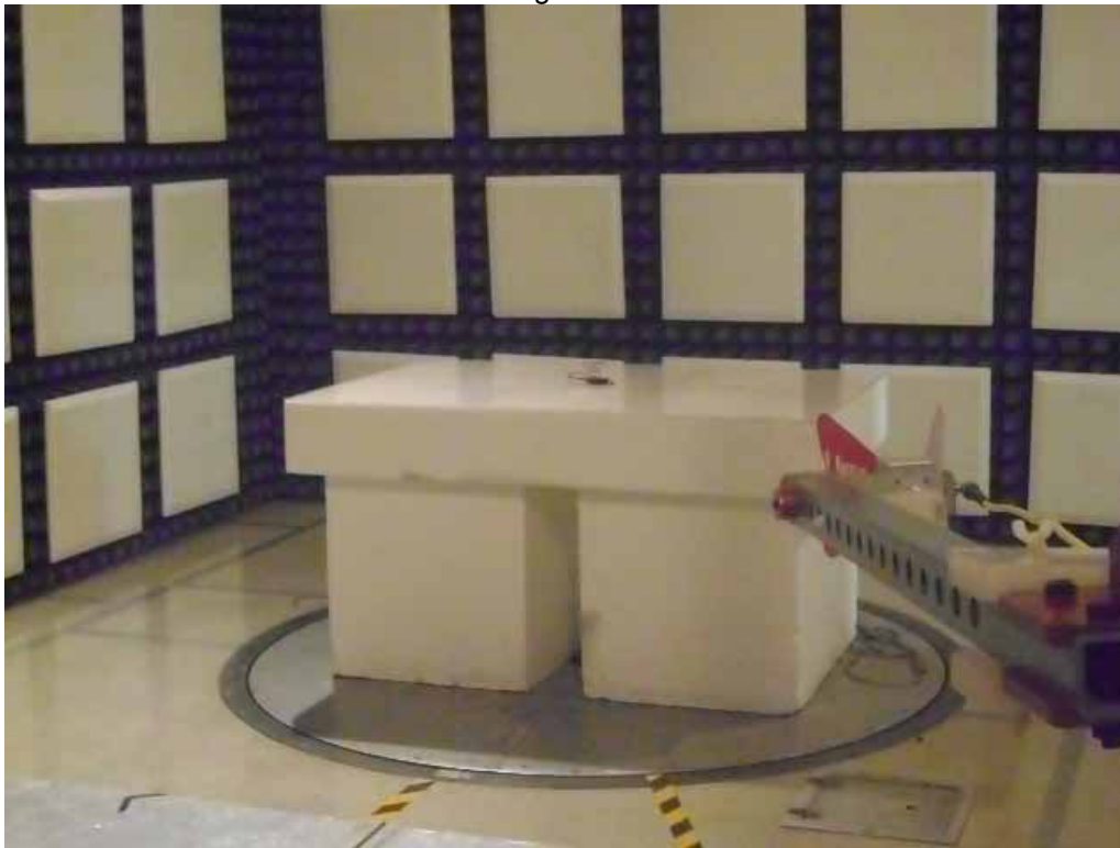
Test Setup for Radiated Emissions, 1GHz to 18GHz – Horizontal Polarization