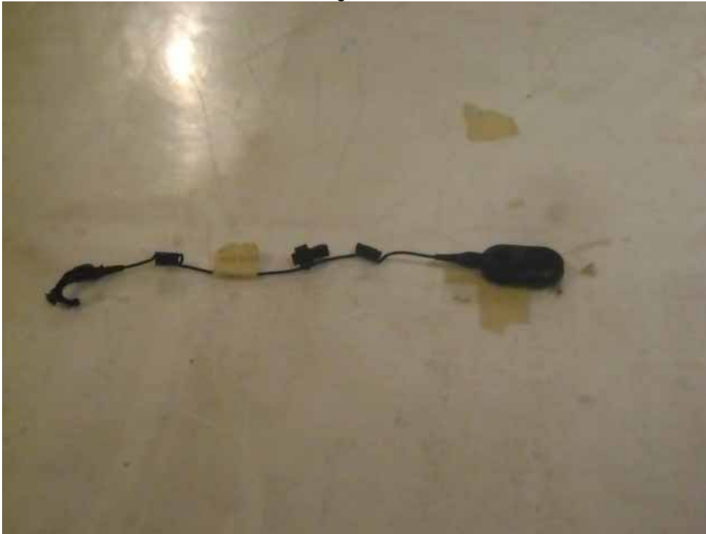
EUT With NTN2572A Headset