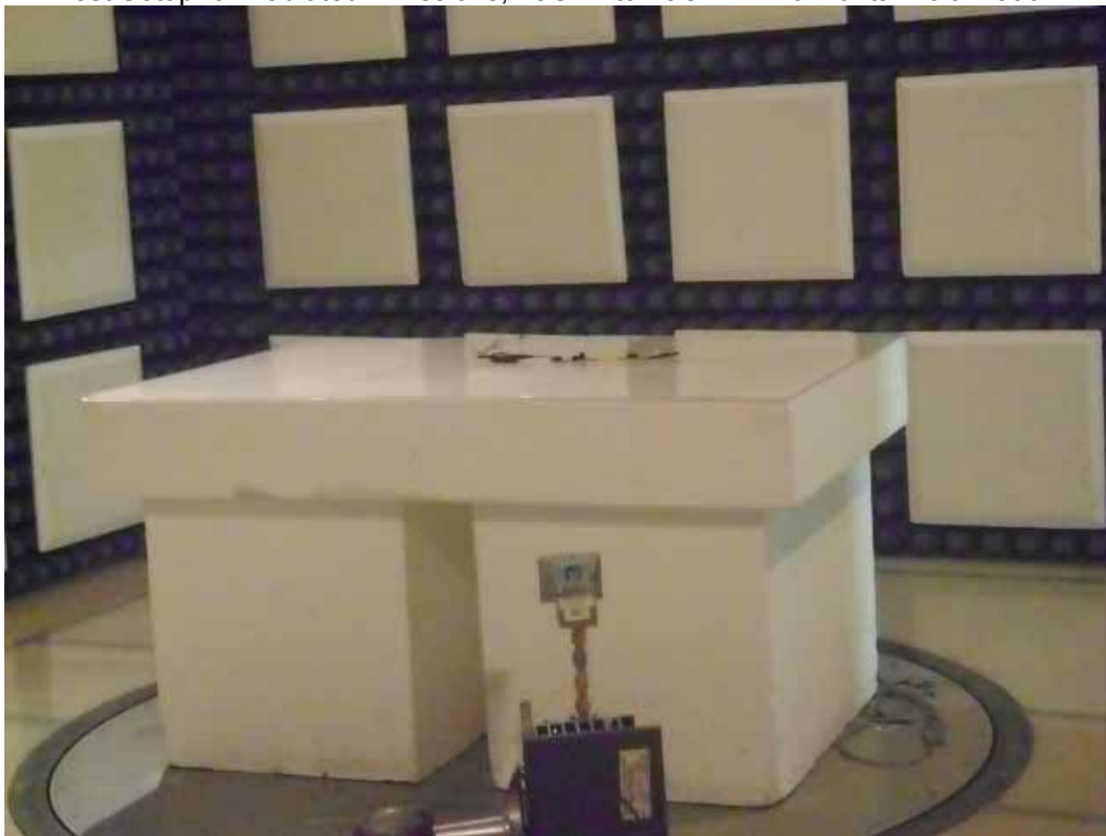
Test Setup for Radiated Emissions, 18GHz to 25GHz – Vertical Polarization