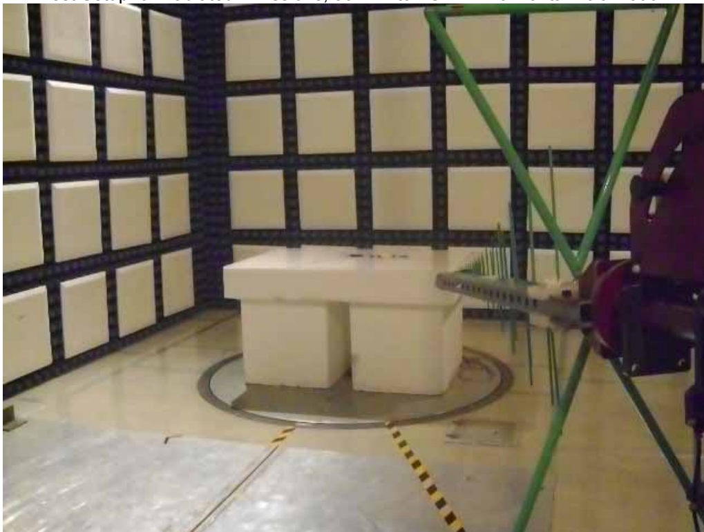
Test Setup for Radiated Emissions, 30MHz to 1GHz – Vertical Polarization