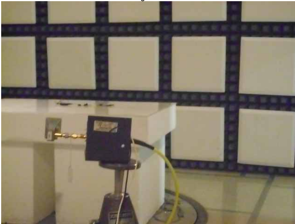
Test Setup for Radiated Emissions, 18GHz to 25GHz – Horizontal Polarization