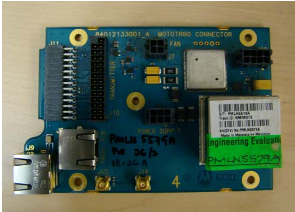
TOP VIEW OF BACK PANEL BOARD