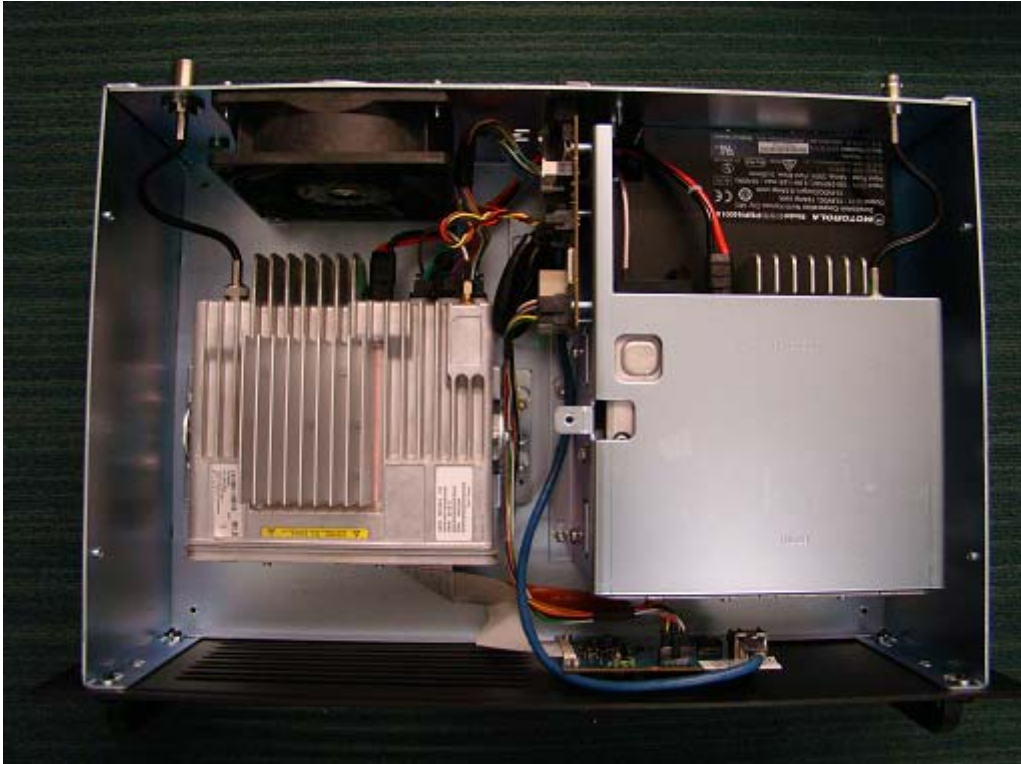
TOP VIEW OF WITH TOP COVER REMOVED