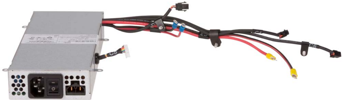
Internal Front View – Power Supply Module

EQUIPMENT TYPE: ABZ99FT4096 109AB-99FT4096