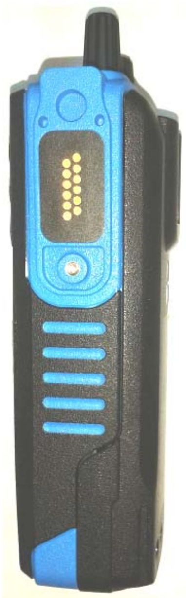
SIDE VIEW (RIGHT)