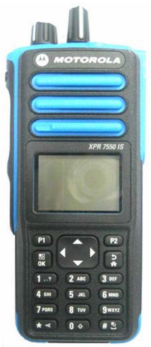
FRONT VIEW WITH DISPLAY AND KEYPAD