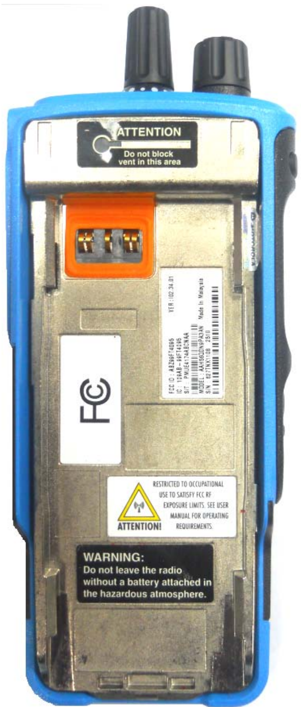
BACK VIEW (FCC LABELS)