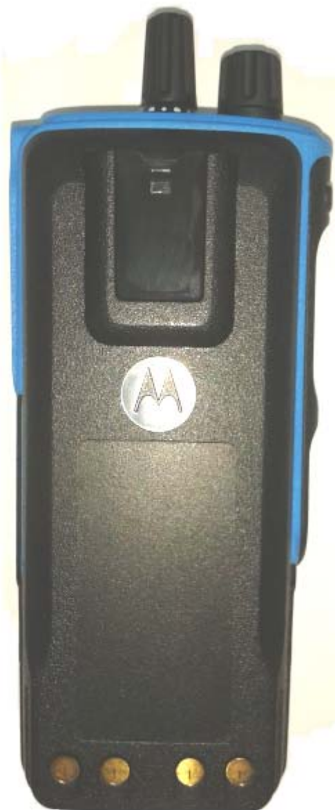
BACK VIEW WITH BATTERY