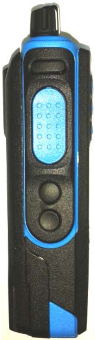
SIDE VIEW (LEFT)