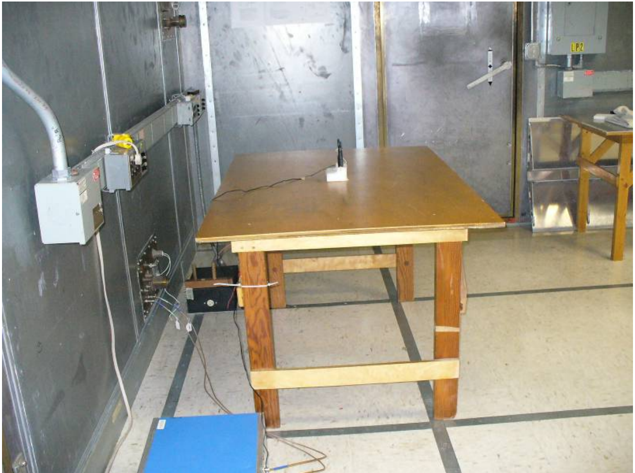
Figure 5: Power Line Conducted Emissions –Side View