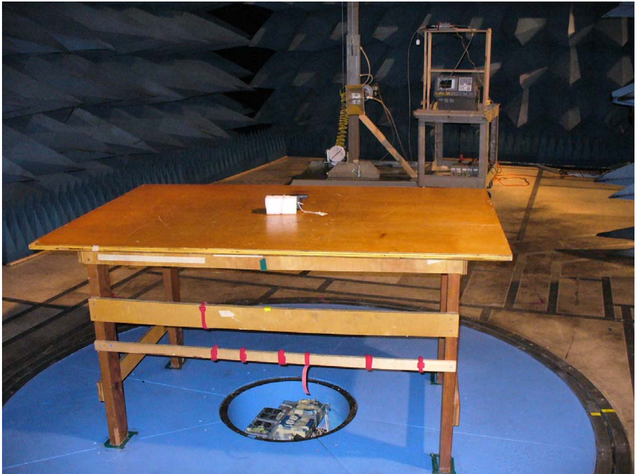
Figure 2: Radiated Emissions –Back View