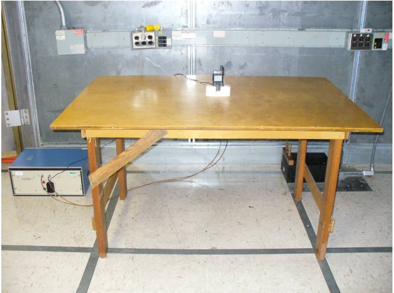
Figure 4: Power Line Conducted Emissions – Front View