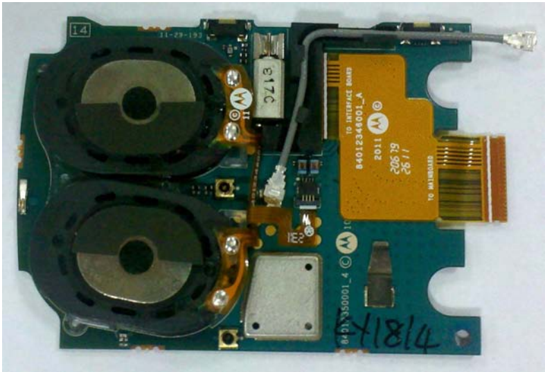
Interface board with Shields (Top)