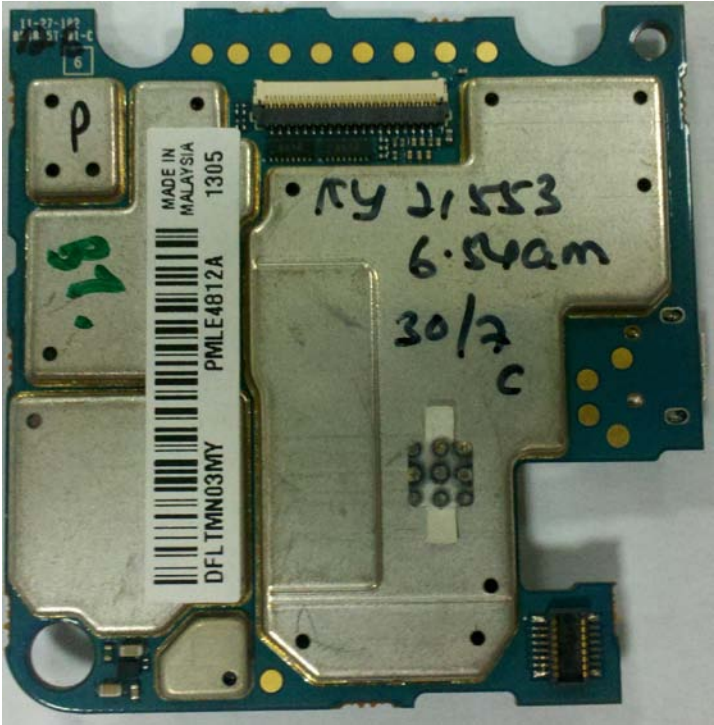
RF board with Shields (Top)