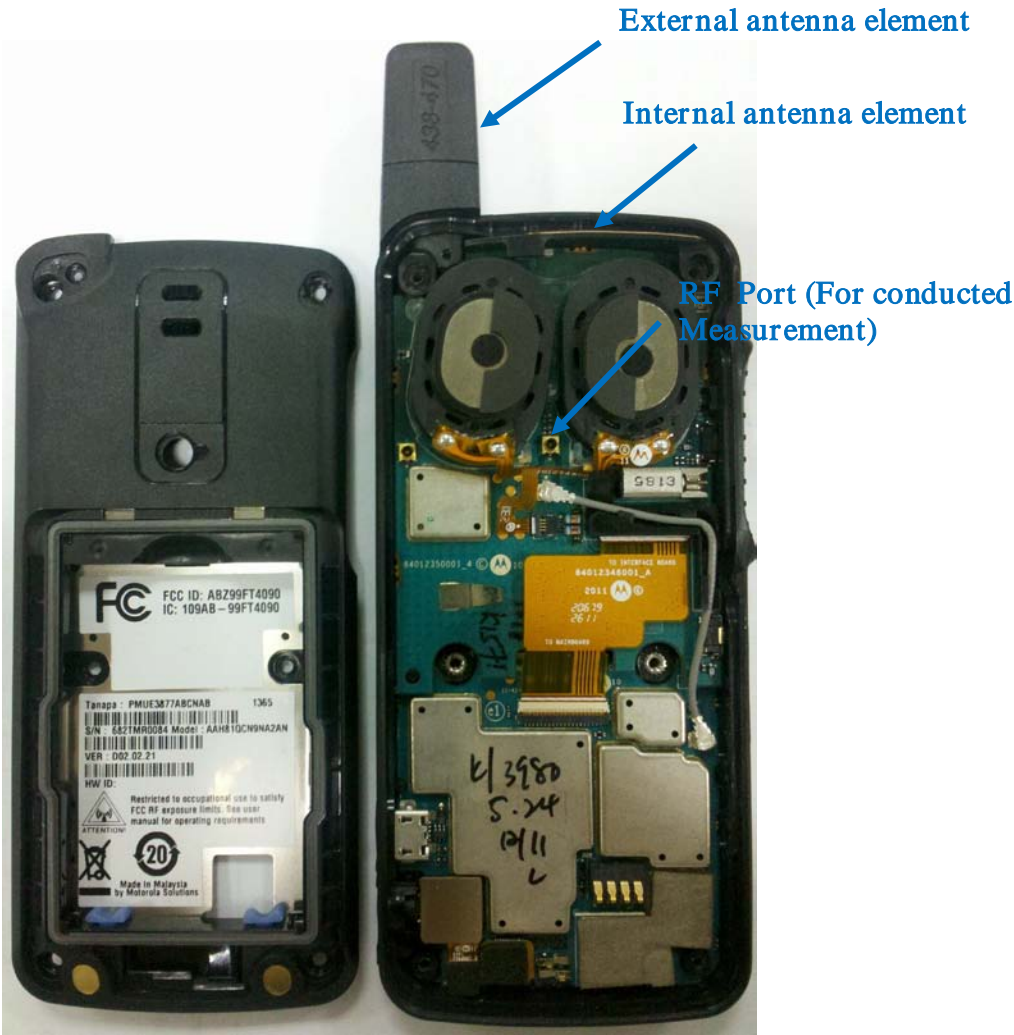
PCB board with housing (Back)