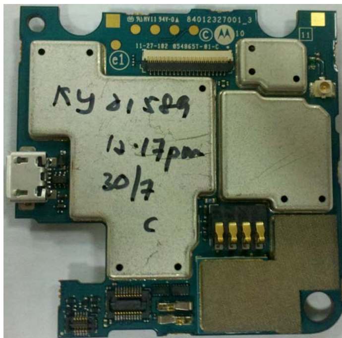
RF board with Shields (Bottom)