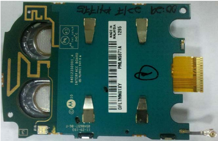
Interface board (Bottom)