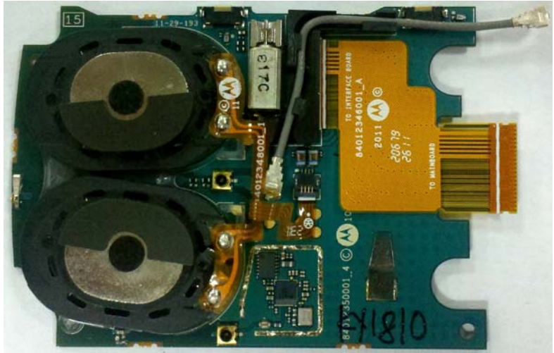
Interface board without shields (Top)