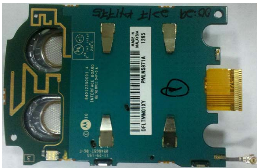
Interface board (Bottom)