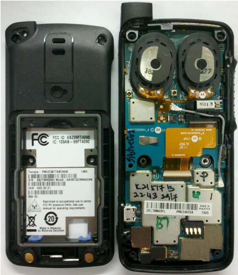
PCB board with housing (Back)