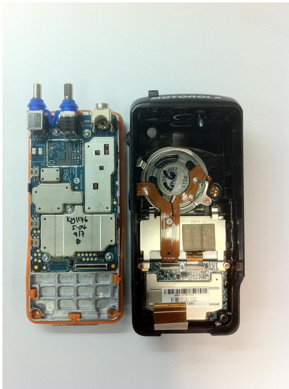
MOTOTRBO UHF complete internal open up view