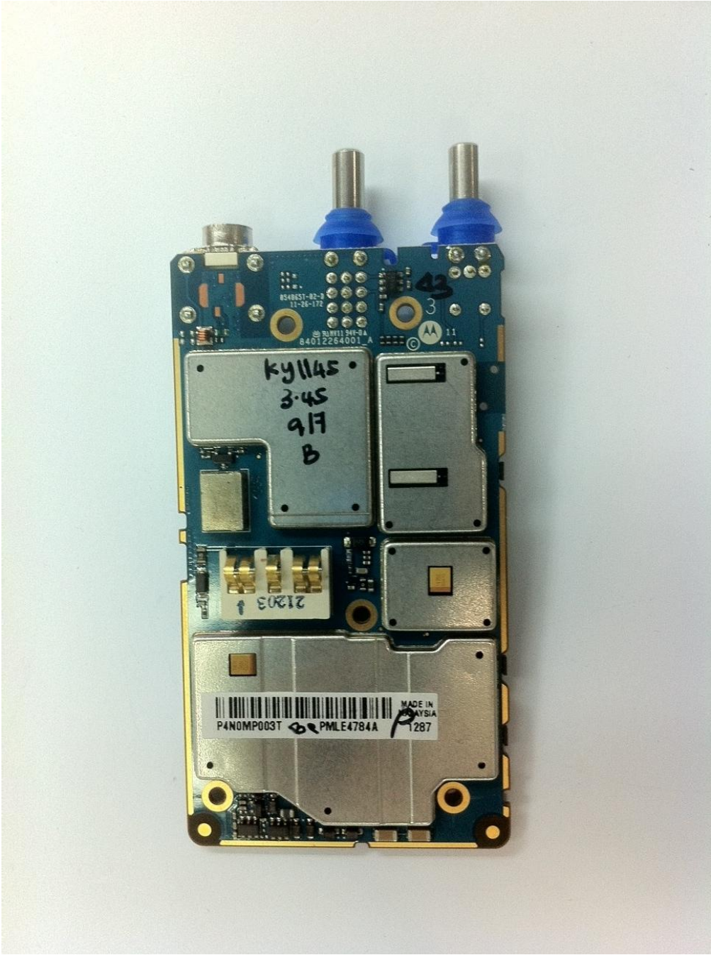
MOTOTRBO UHF RF Board with shield (Bottom)