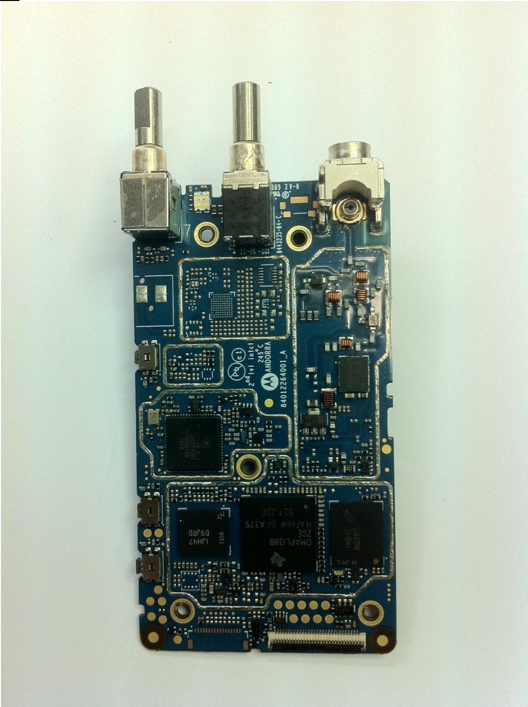
MOTOTRBO UHF RF Board without shield (Top)