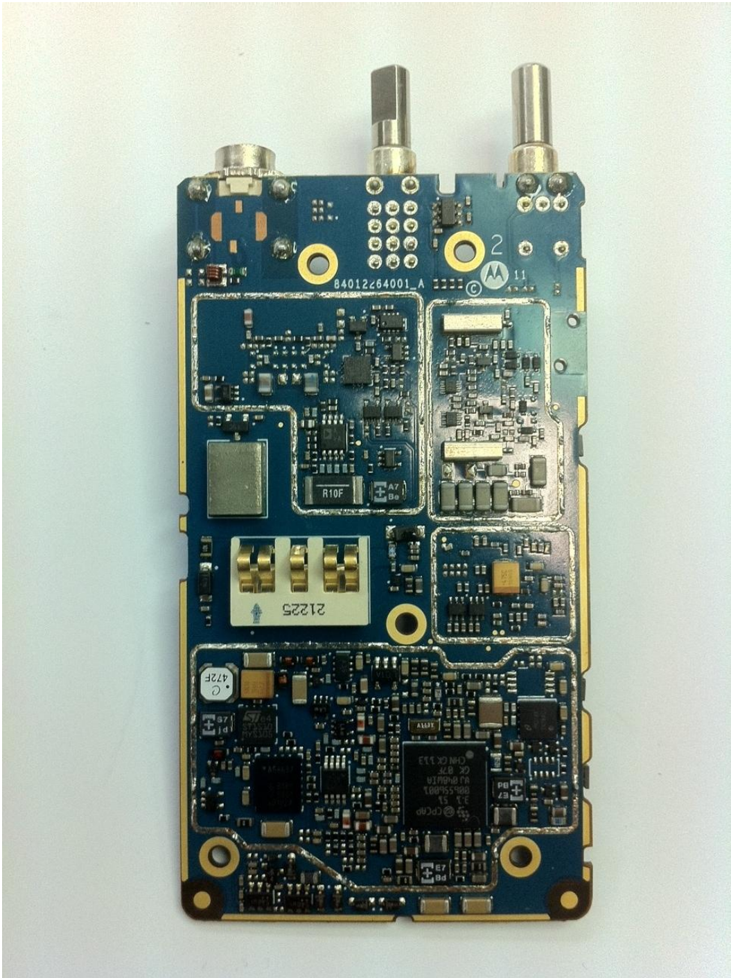
MOTOTRBO UHF RF Board without shield (Bottom)