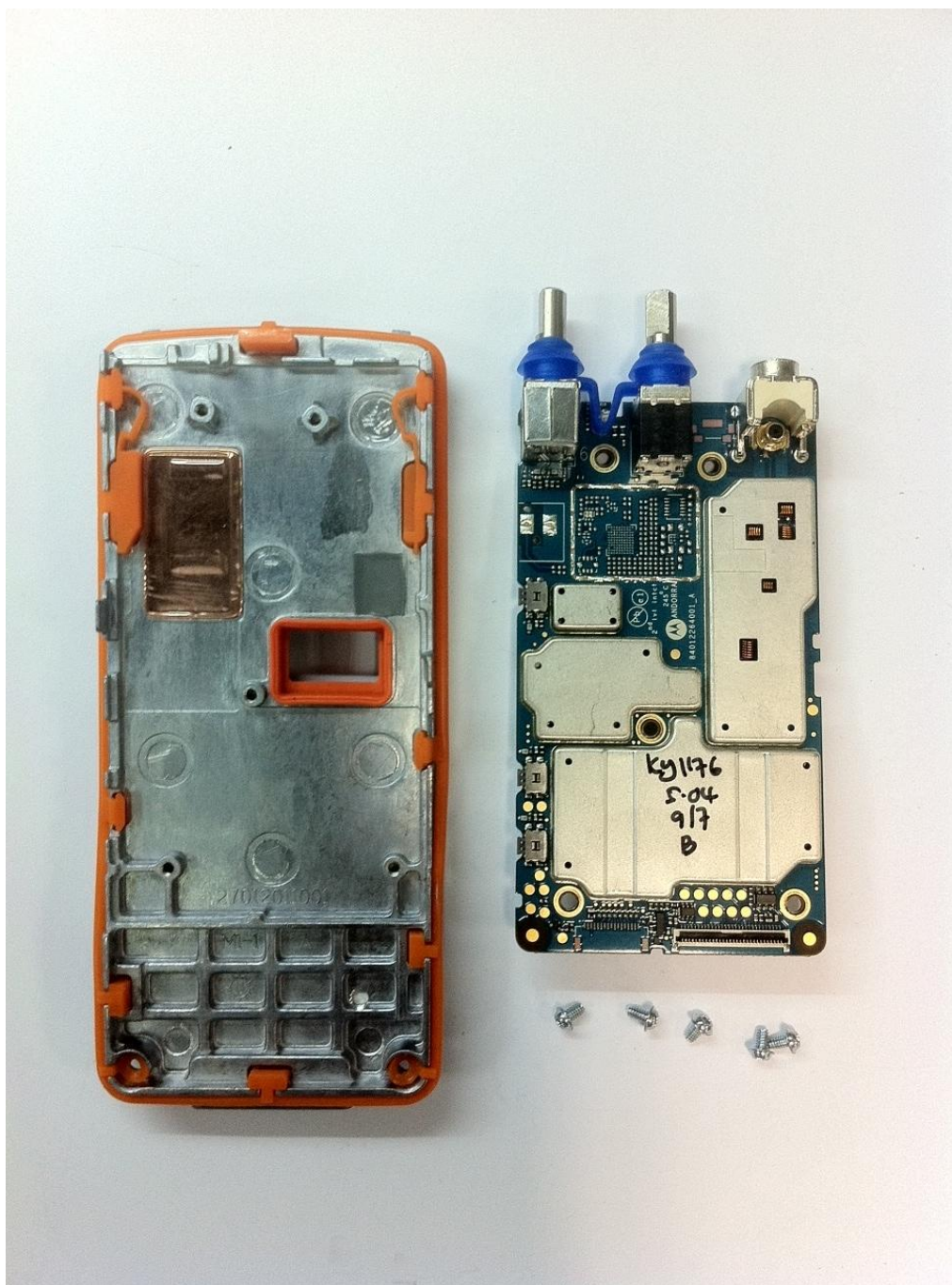
MOTOTRBO UHF Chassis and RF Board