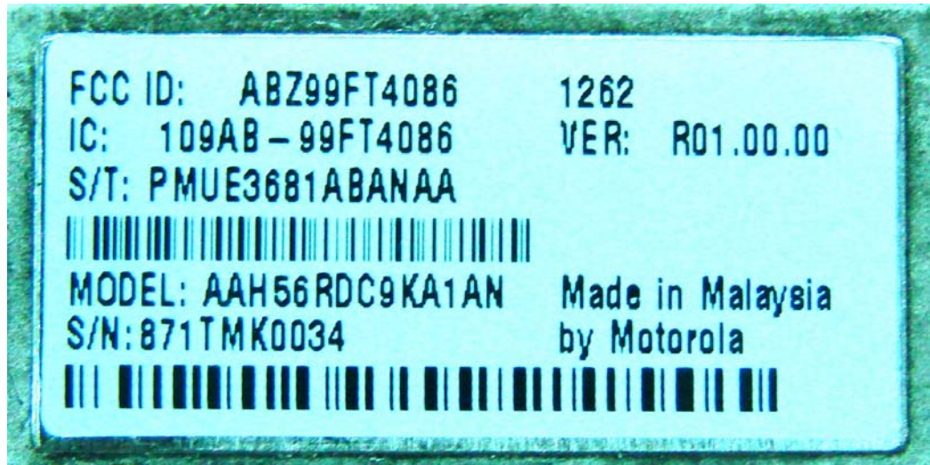
FIGURE 1-2: FCC LABEL FOR SALES MODEL AAH56RDC9KA1AN