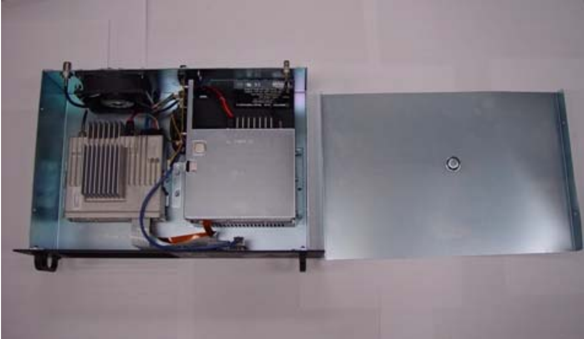
TOP VIEW OF WITH TOP COVER REMOVED