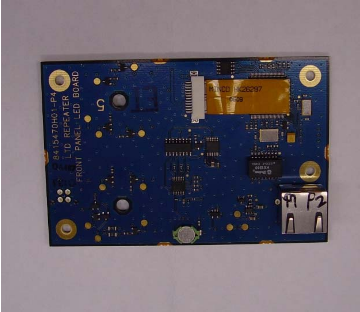
TOP VIEW OF FRONT PANEL LED BOARD