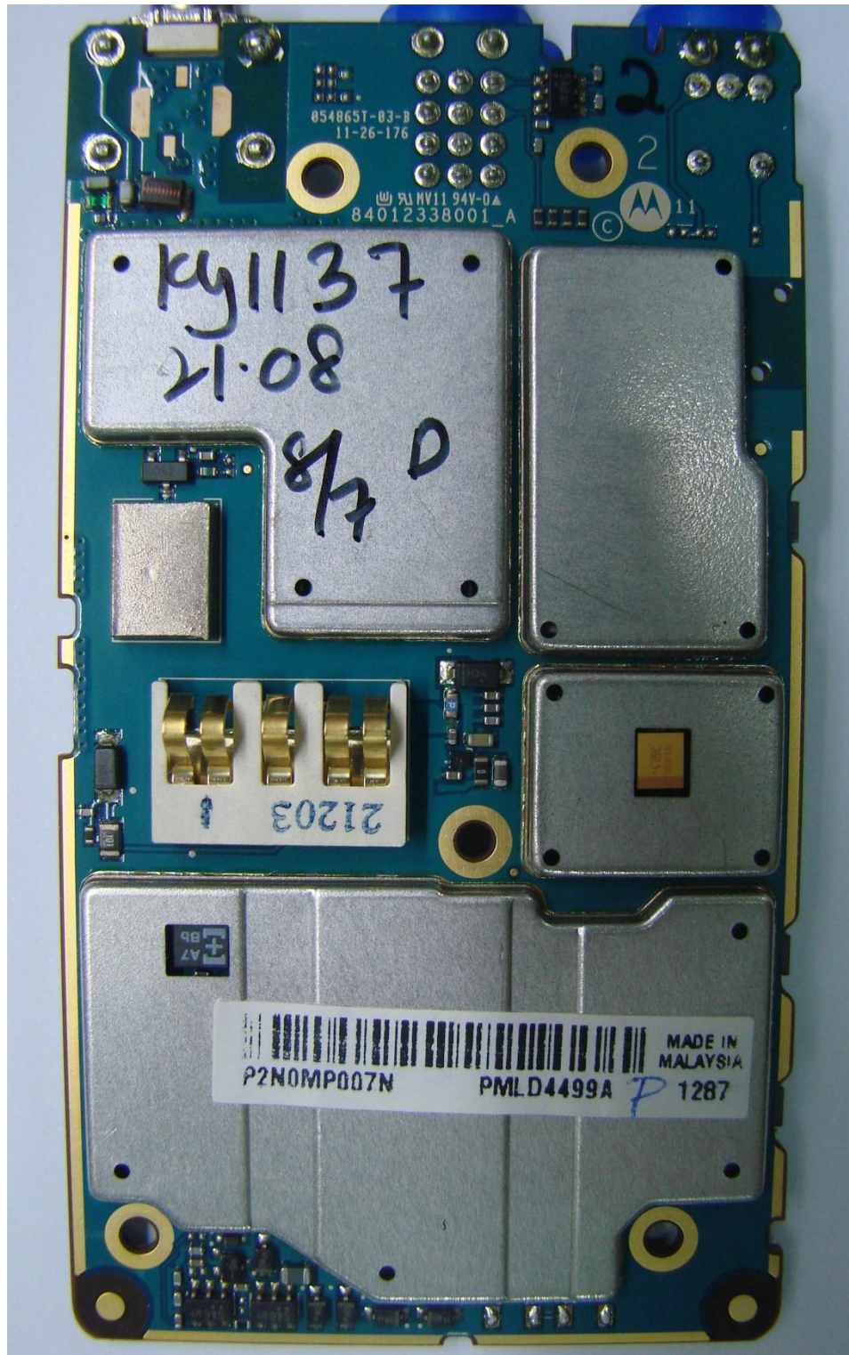
MOTOTRBO VHF RF board with Shields (Bottom)