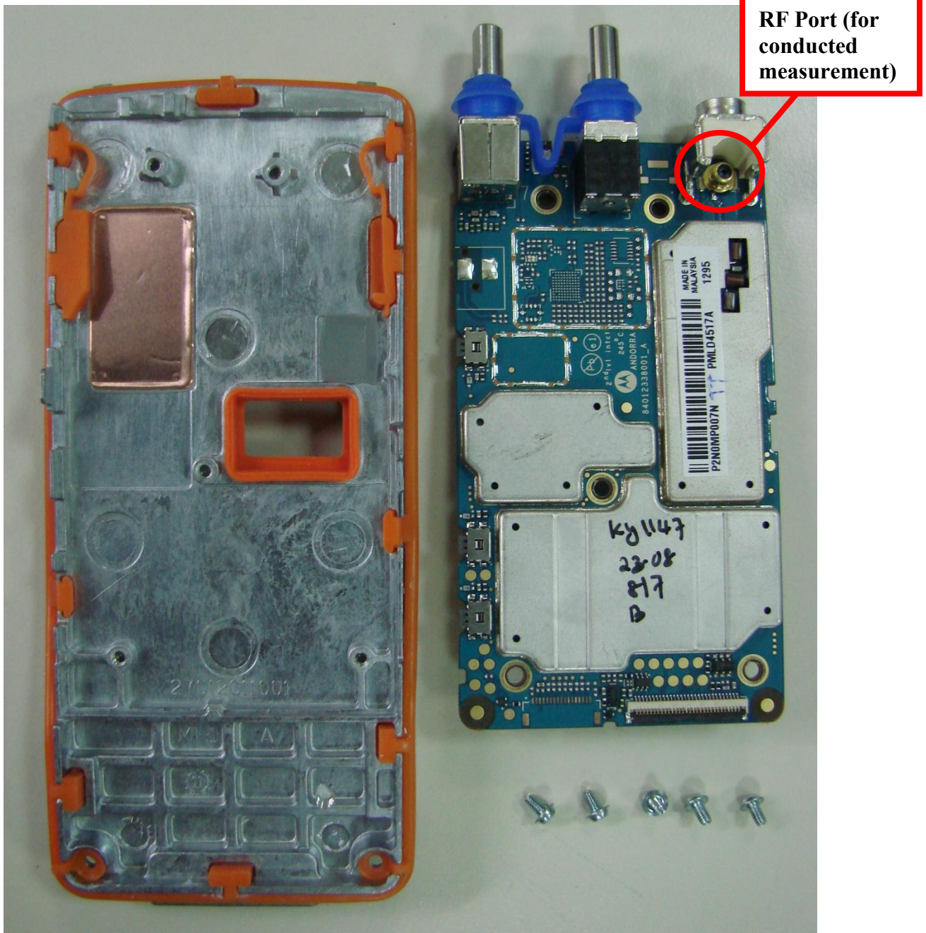
MOTOTRBO VHF Chassis and RF board