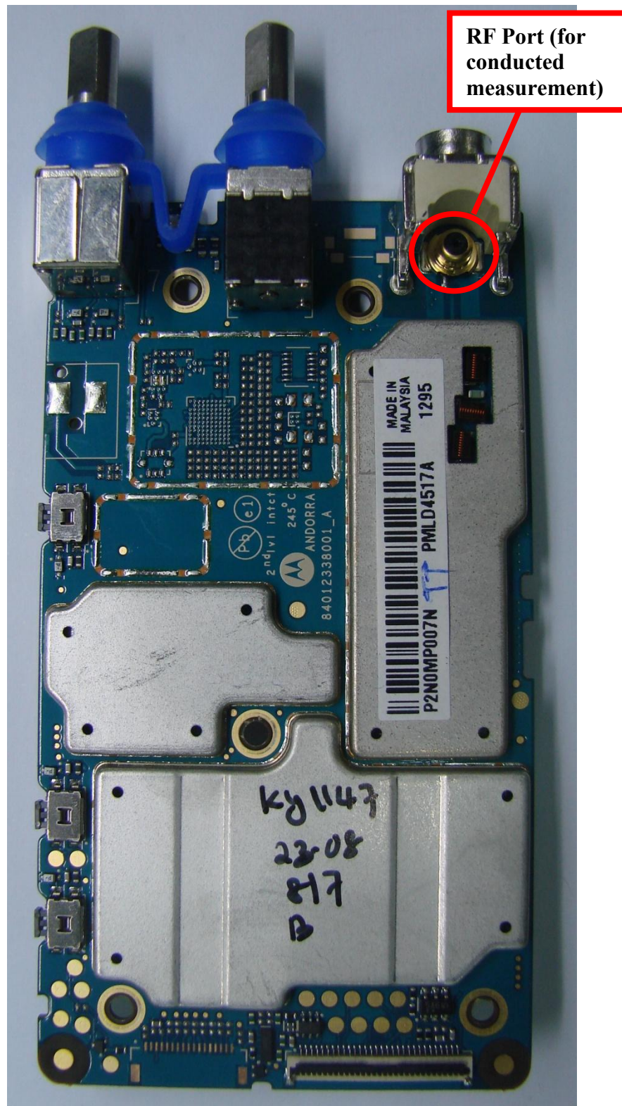
MOTOTRBO VHF RF board with Shields (Top)