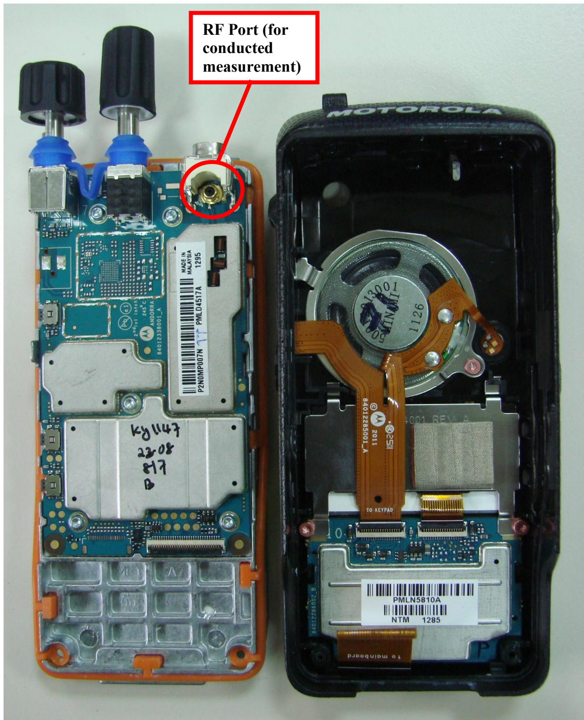
MOTOTRBO VHF complete internal open up view