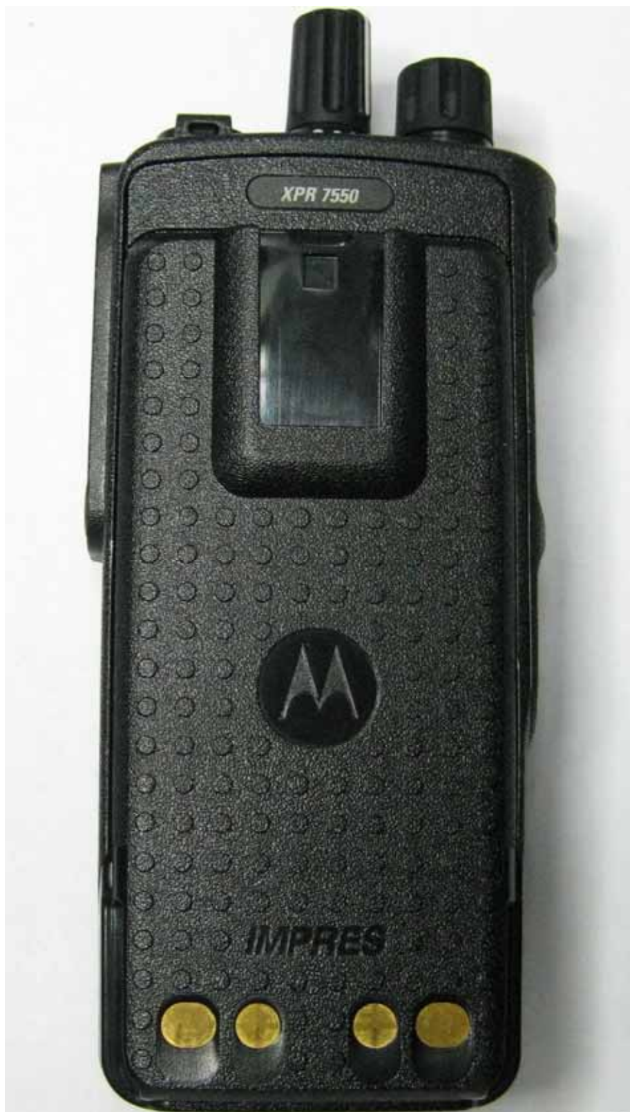
Back view (with battery)