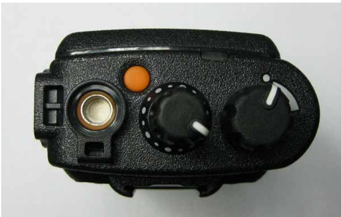
TOP VIEW WITHOUT Antenna