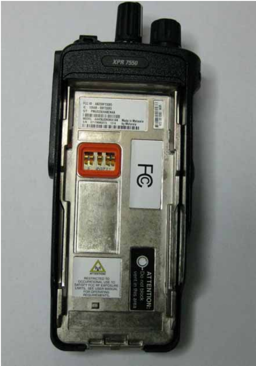
Back View without battery (FCC Label Location).