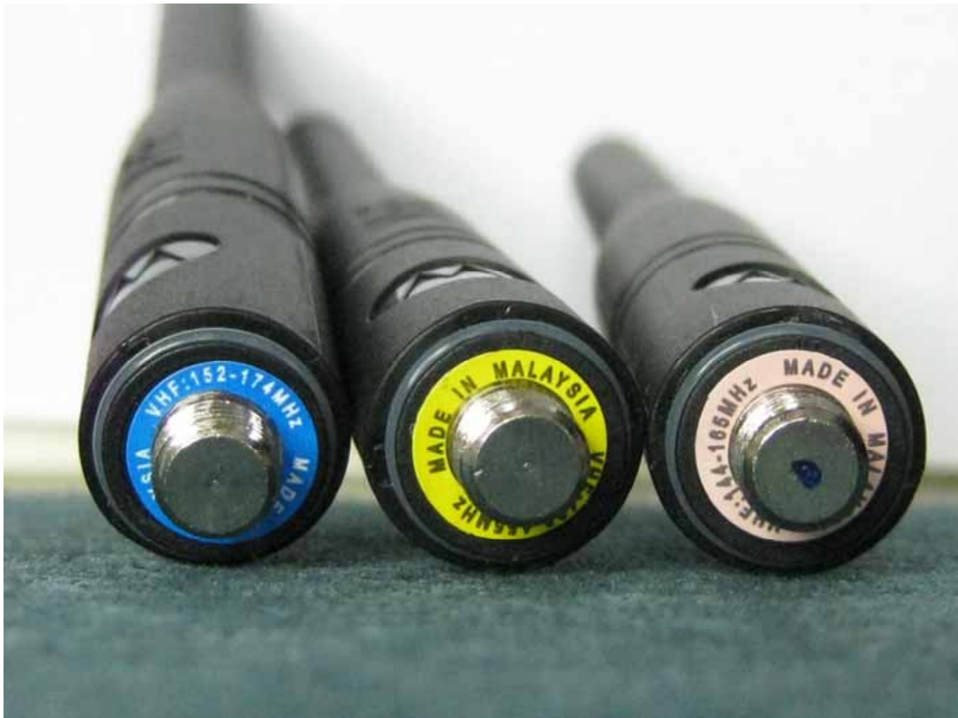
Antenna (3 color code for 3 different frequency ranges)