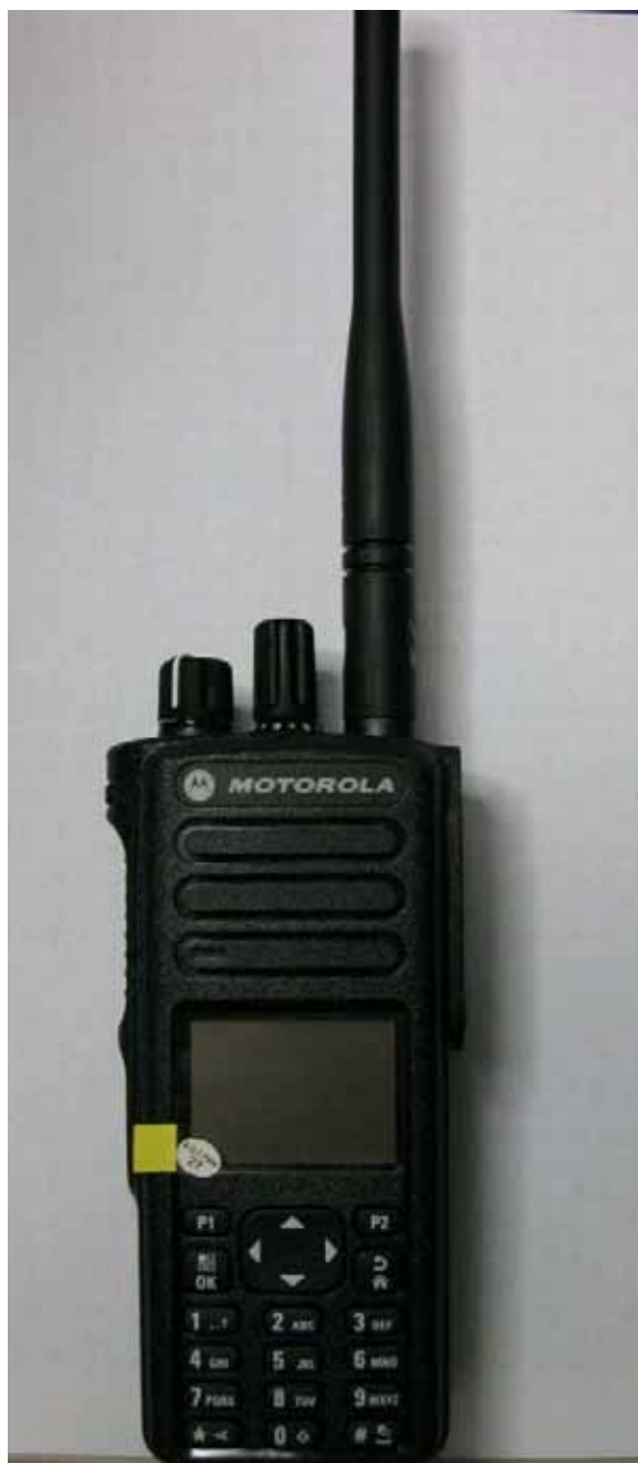
Front view (with Antenna)