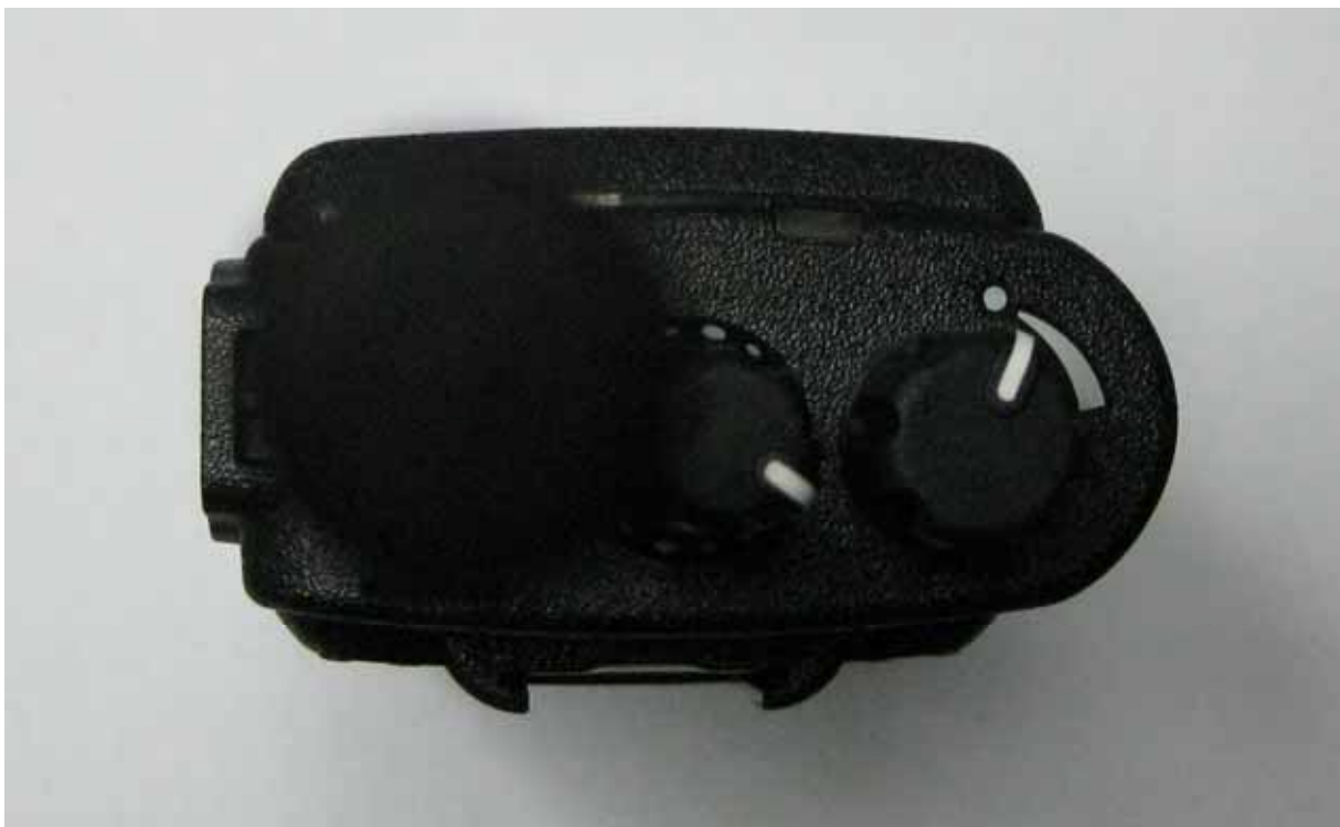
TOP VIEW WITH Antenna