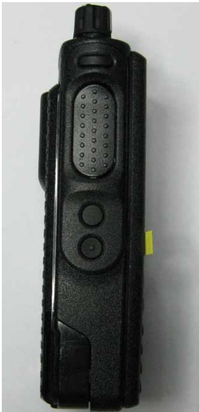
Side View (Left) PTT button side