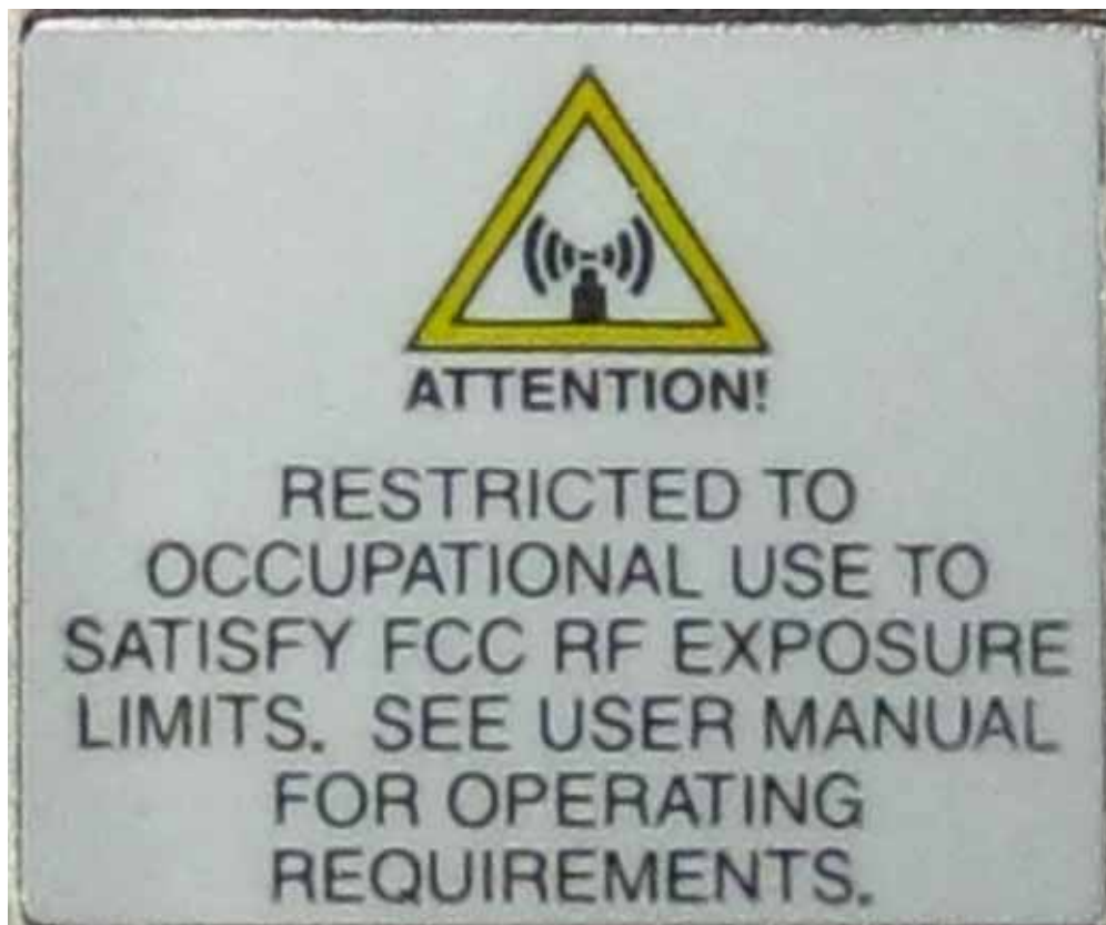
RF Exposure Label (Close View)