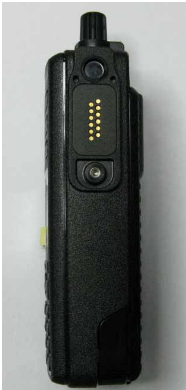
Side View (Right) connector side