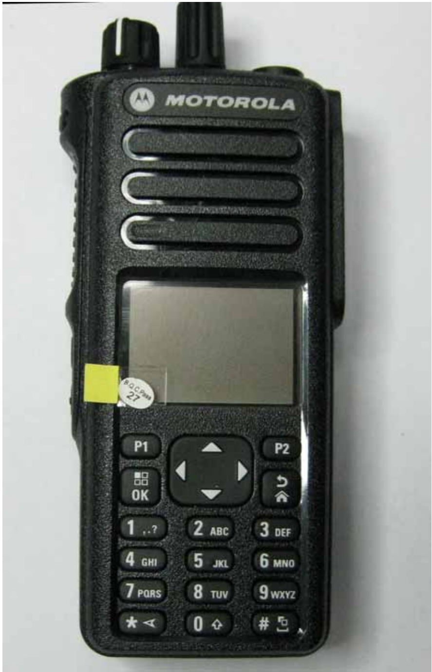
Front view (without Antenna)