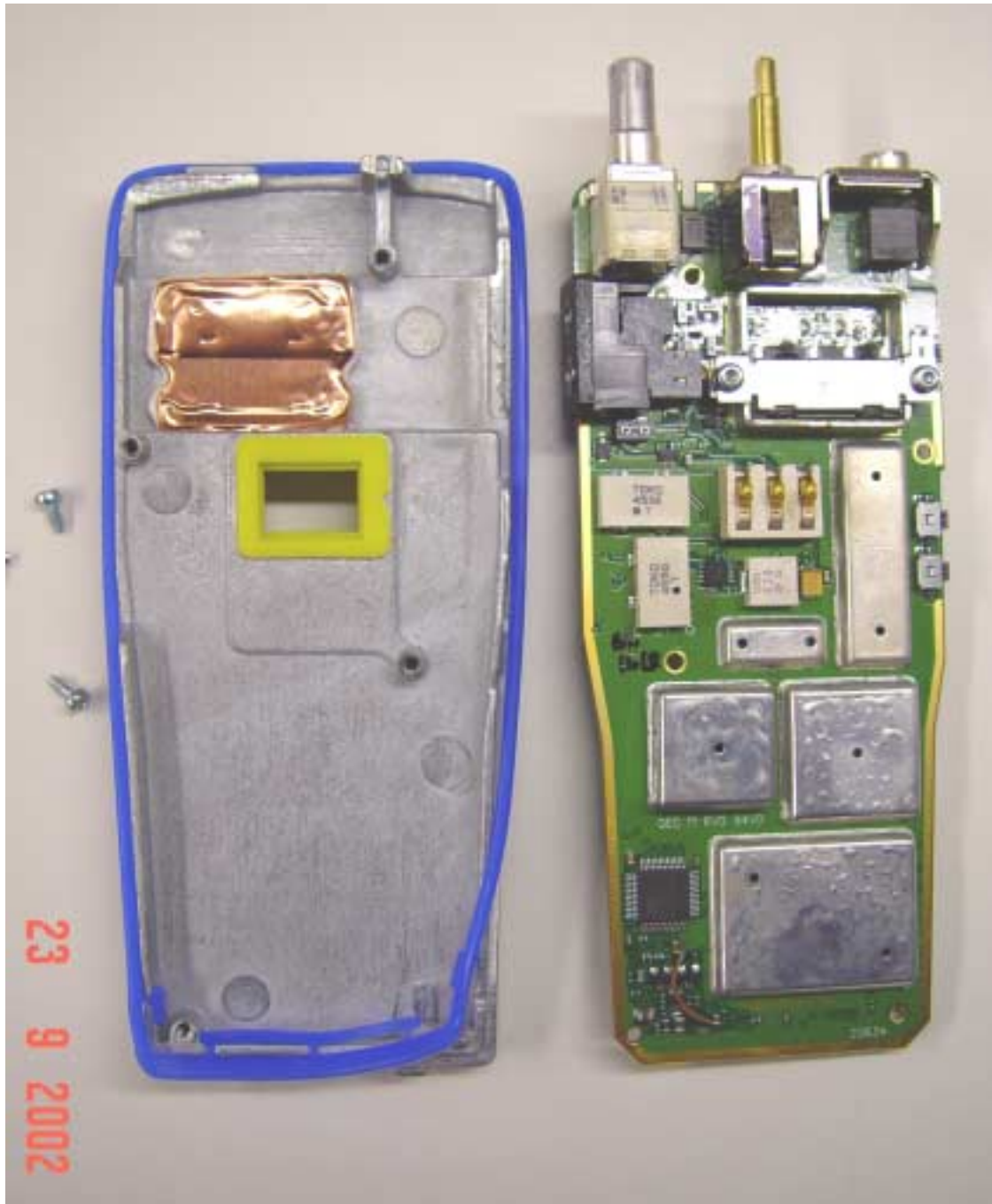
VIEW OF CIRCUIT BOARD REMOVED FROM CHASSIS (MATING SURFACES OF CIRCUIT BOARD AND CHASSIS ARE SHOWN)