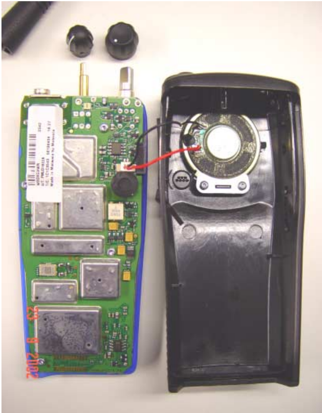
REAR VIEW WITH CIRCUIT BOARD REMOVED FROM HOUSING (MATING SURFACES OF BOARD AND HOUSING ARE SHOWN)