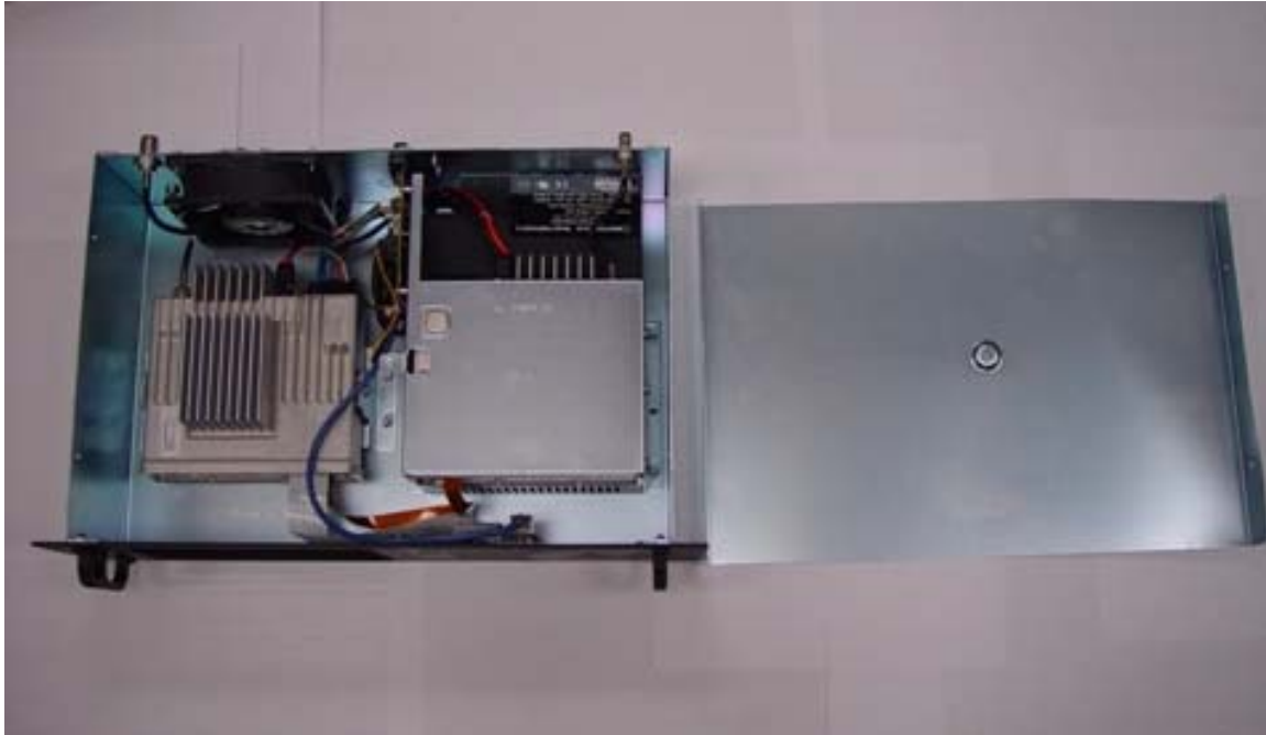
TOP VIEW OF WITH TOP COVER REMOVED