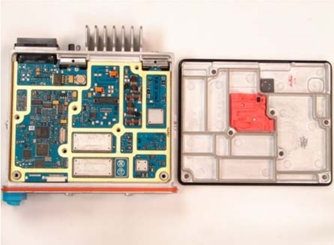
TOP VIEW WITH RADIO CIRCUIT BOARD REMOVED FROM CHASSIS (MATING SURFACES OF CIRCUIT BOARD AND CHASSIS ARE SHOWN)