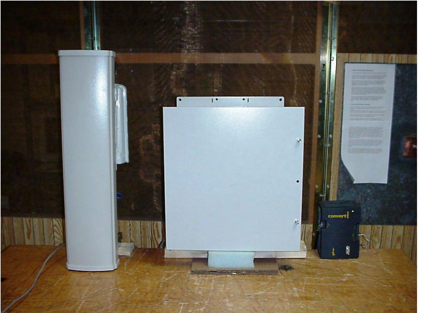
AC LINE COND FRONT