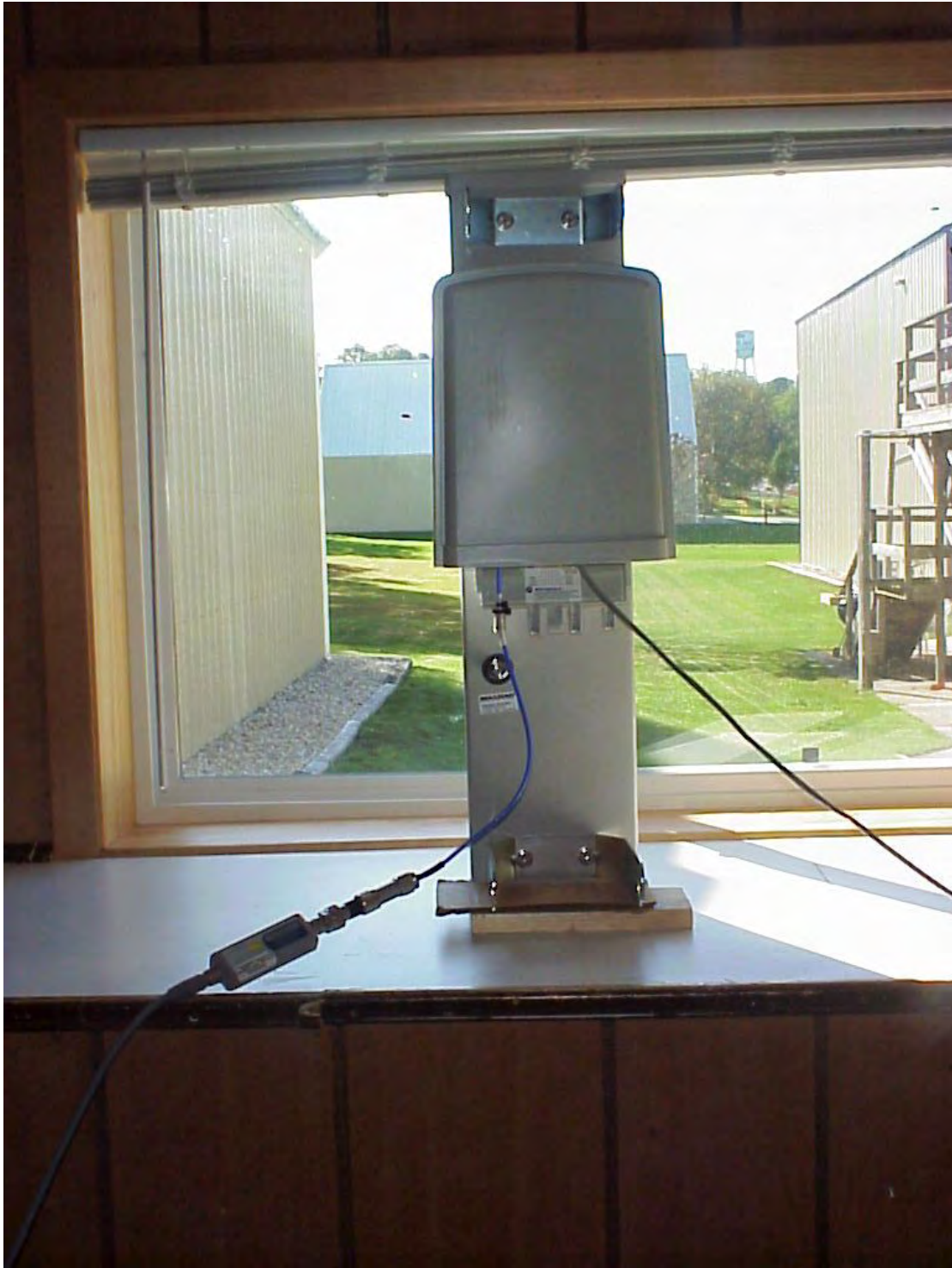
RF CONDUCTED OUTPUT POWER