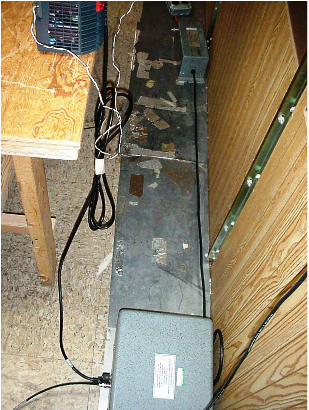
AC LINE COND BACK 2