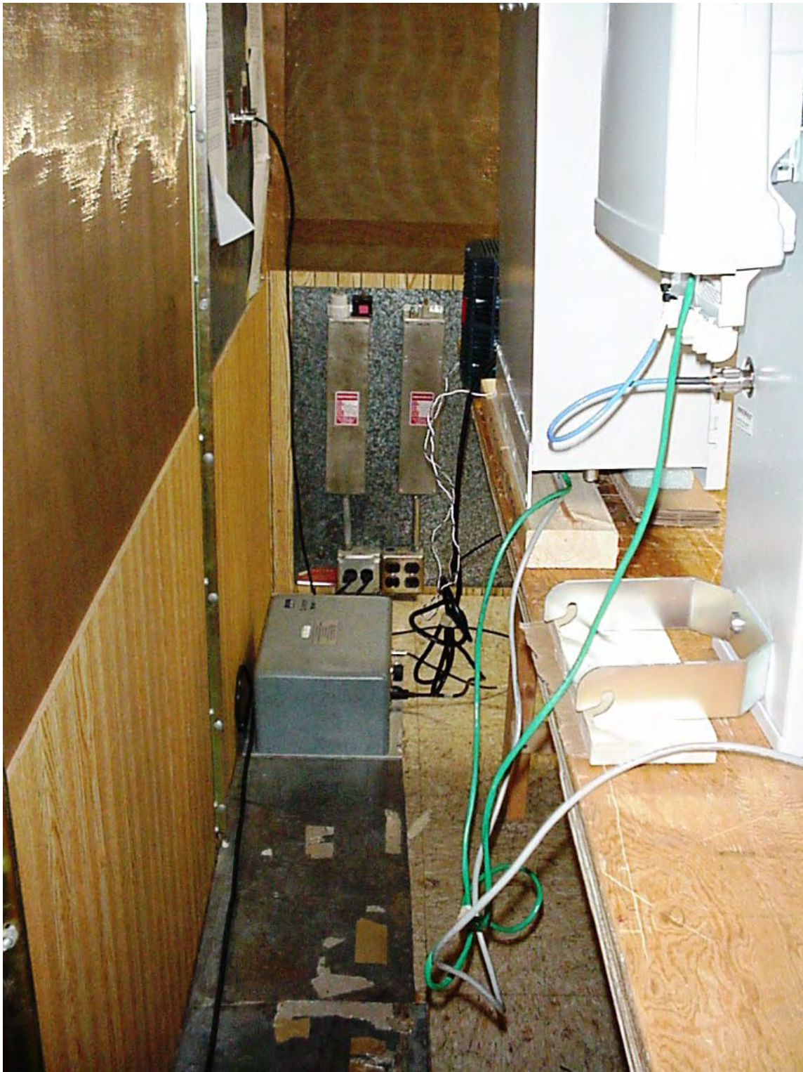
AC LINE COND BACK 1