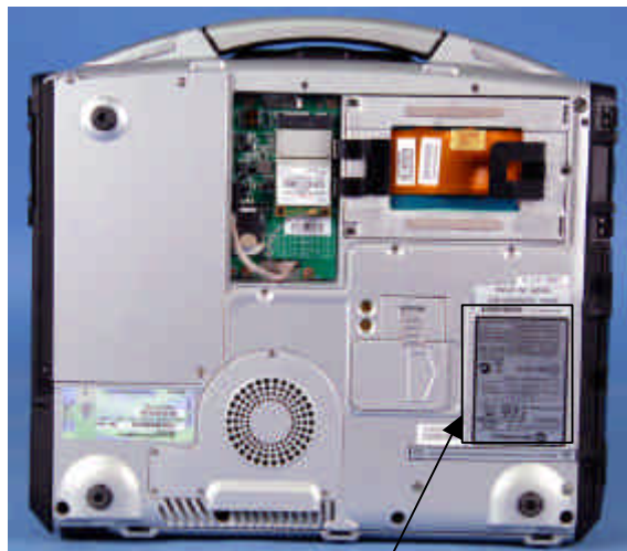
Figure A-3. FCC ID Label Location