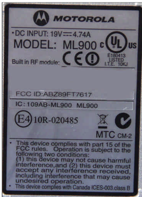
Figure A-1. FCC ID Label

Note: The FCC ID shown will be readily visible at the time of purchase.