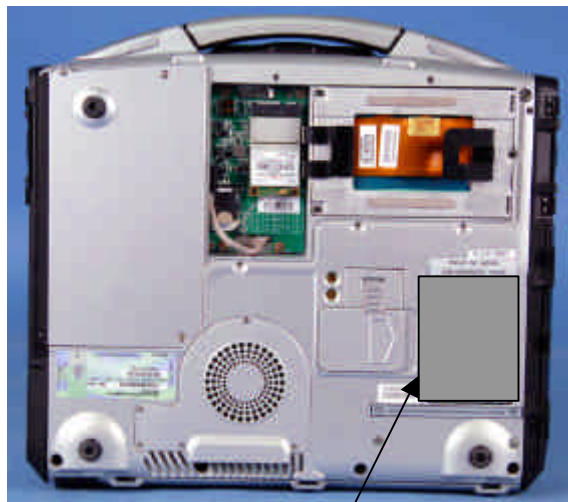
Figure A-3. FCC ID Label Location