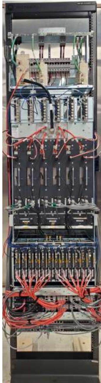
External Front View of D-Series Multicarrier Radio Site