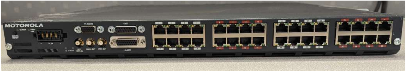
External Front of DSC8500