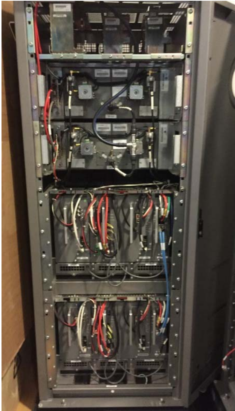
External Front View of MTS 4