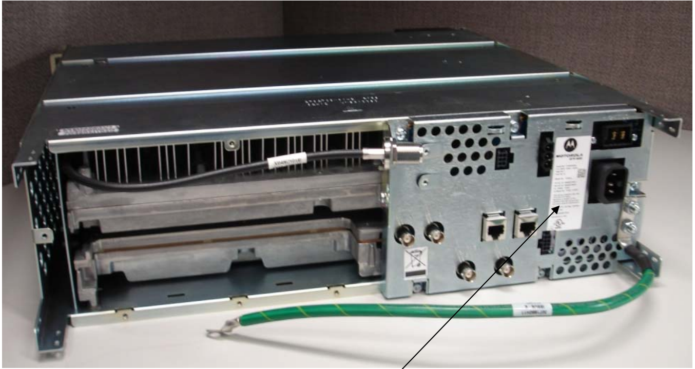
Location of FCC / IC Identification Label

The location of the identification label is on the back of the radio, as shown in the photograph below.