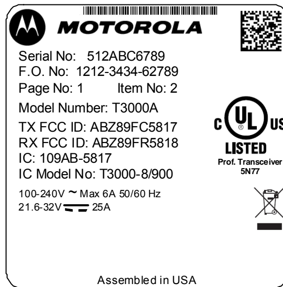
FCC Identification Label

Much of the information that is on the label, such as serial number, model number, etc. is driven by the ordering process and is unique per customer order.