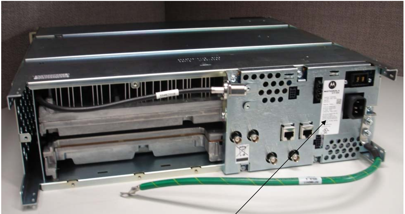
Location of FCC / IC Identification Label

The location of the identification label is on the back of the radio, as shown in the photograph below.